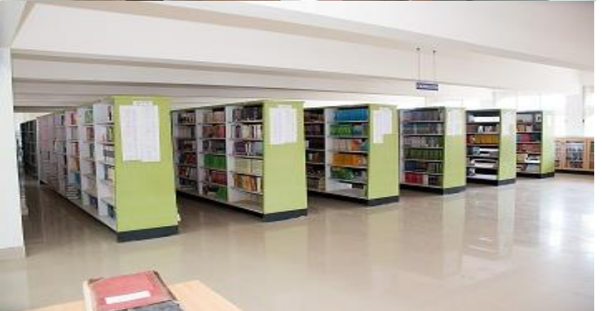
Library Facility photo