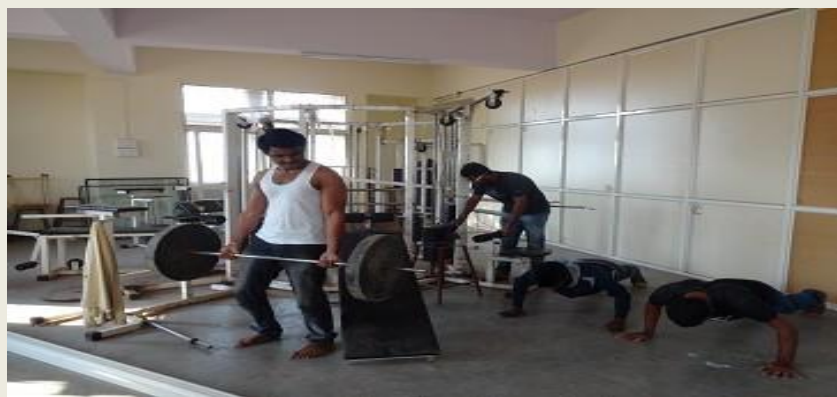
Facilities for disabled Photo