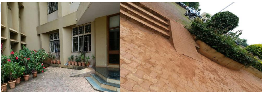
Any other facilities Photo