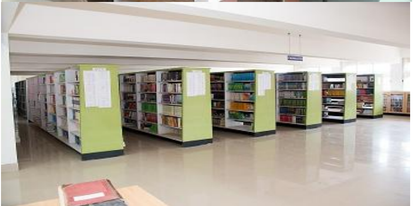
Library Facility photo