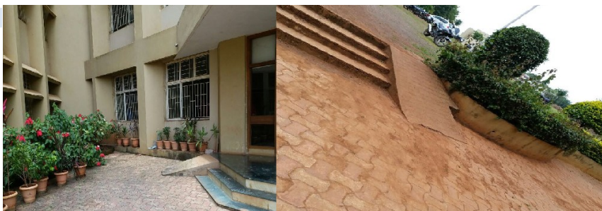
Any other facilities Photo