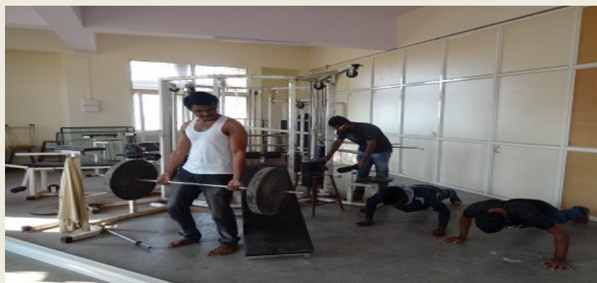
Facilities for disabled Photo