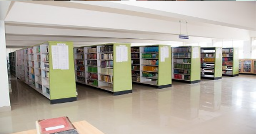
Library Facility photo