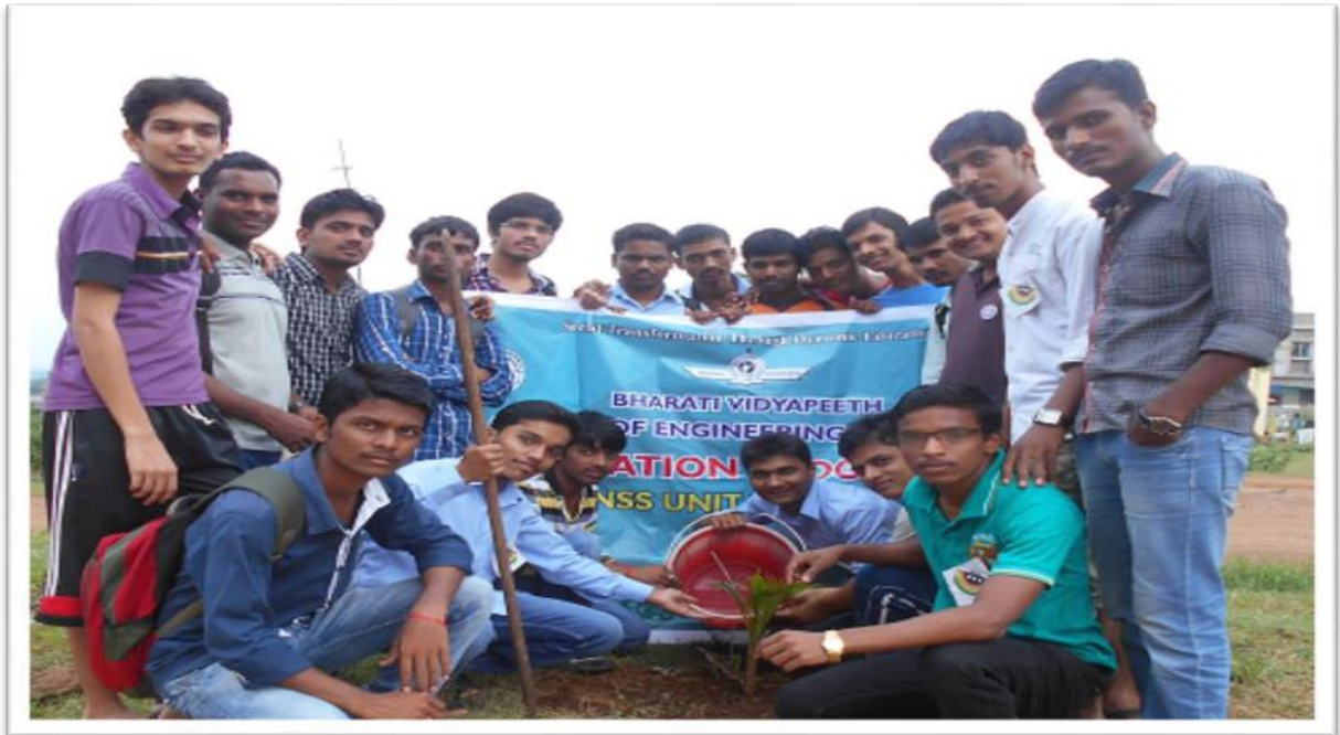
'SWACHHTA ABHIYAN' at Panhala fort.on07/03/2020