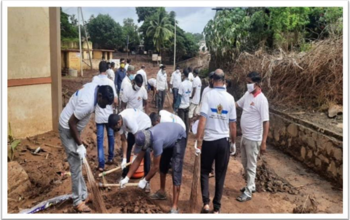
NSS Volunteers Collecting plastic waste on road 02/07/2021