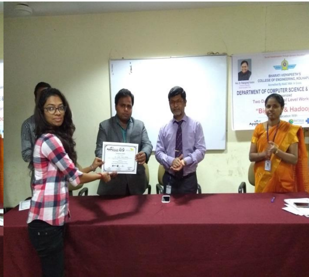
Certificates distribution to merit students at the end of workshop