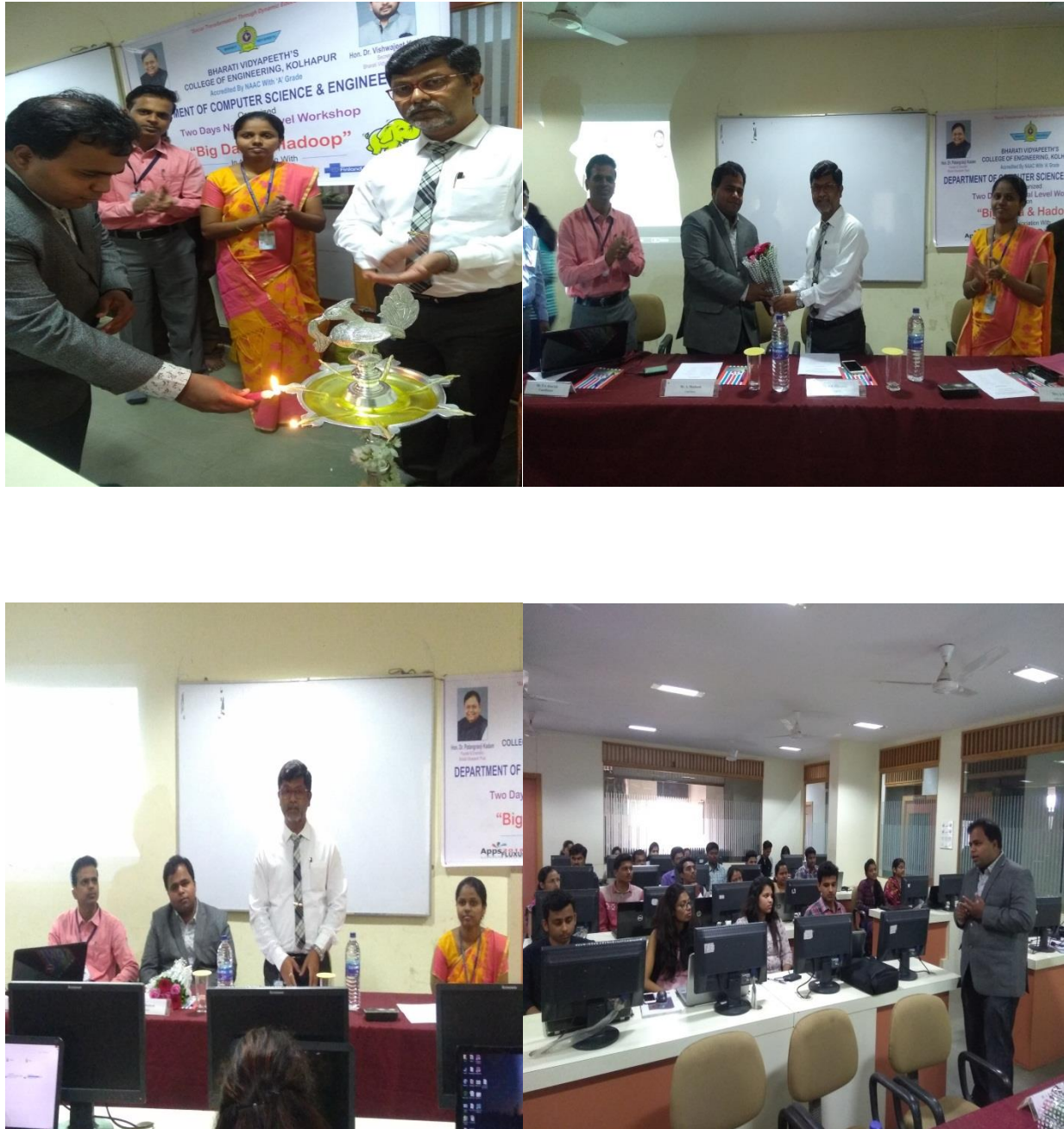
Inaugural Function of 2 days Workshop cum Championship on “Big Data & Hadoop”