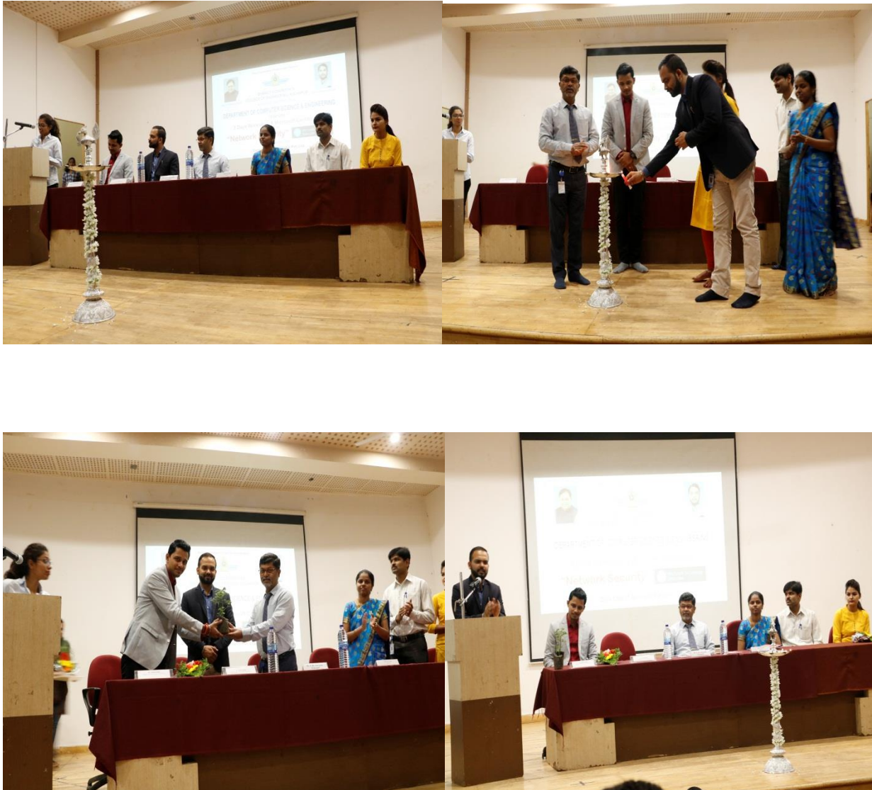
Inaugural Function of 3 days Workshop and Microsoft Certification on Network Security

registered candidates on 5 th April 2018. These Certifications are very essential for final year students to upgrade their profile as well as technical skills. Students and trainers had healthy discussion to improve the overall practical knowledge of network security. They also had given valuable feedbacks to improve overall quality of workshop.