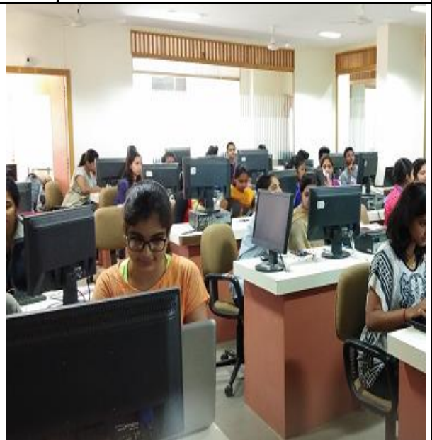
Students performing Practical on Arduino Board