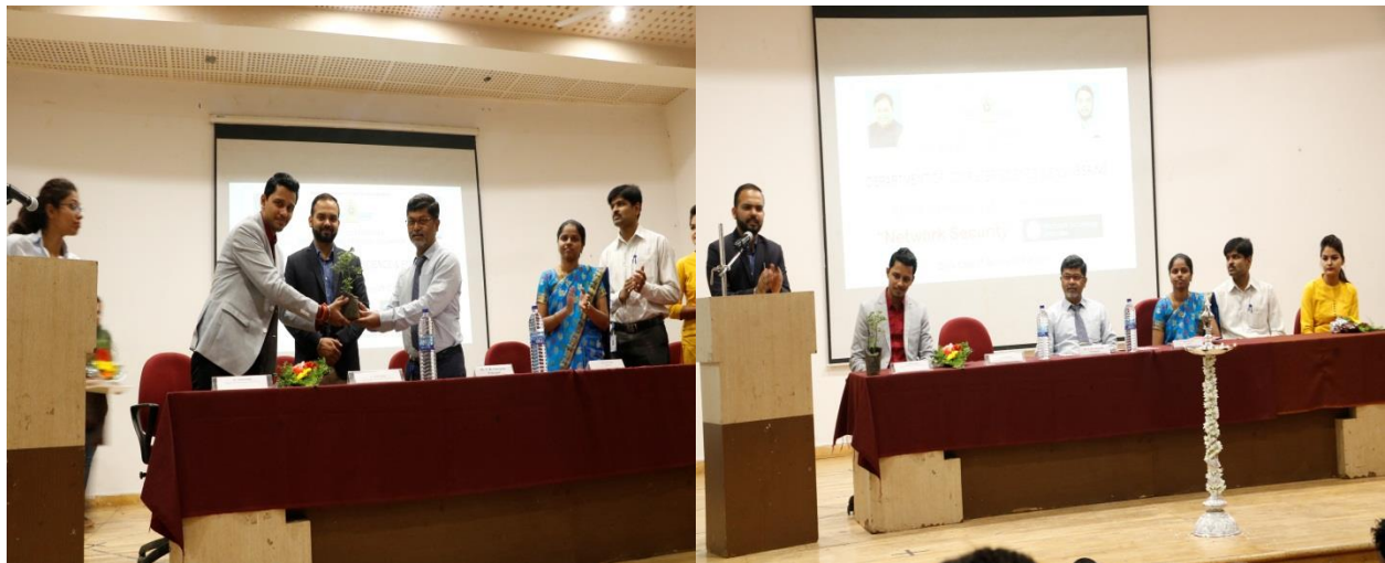
Inaugural Function of 3 days Workshop and Microsoft Certification on Network Security