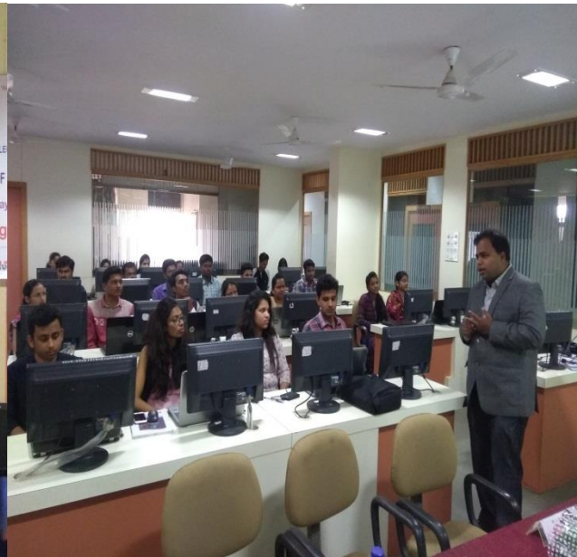
Inaugural Function of 2 days Workshop cum Championship on “Big Data & Hadoop”