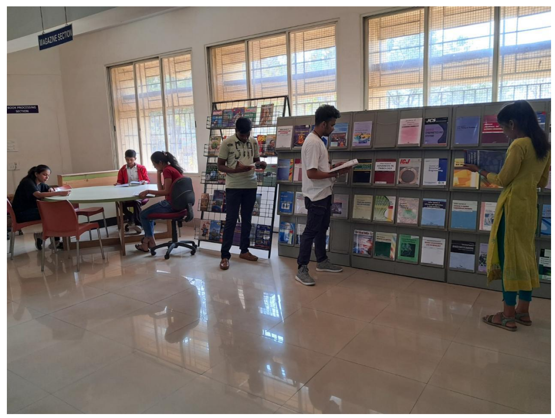
Journals and Periodicals Section