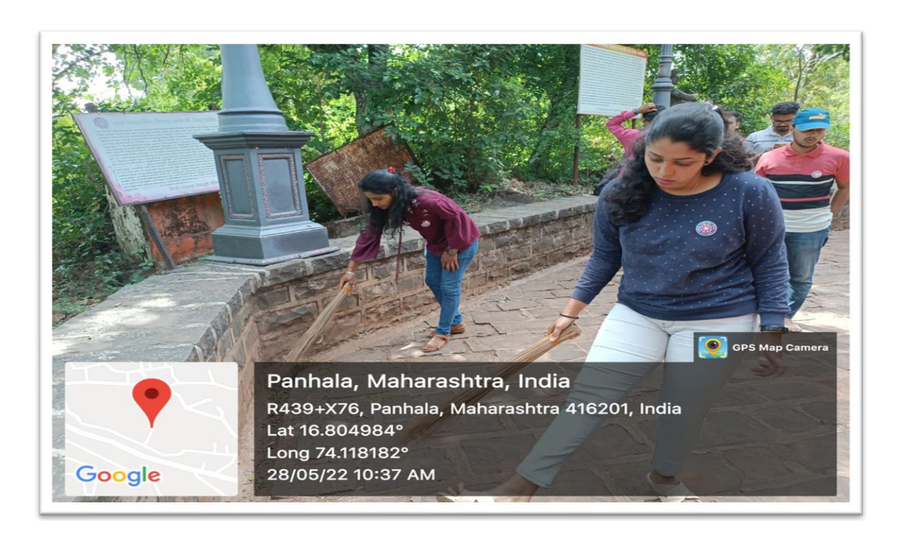
NSS Volunteers-Cleaning at Samadhi Parisar.