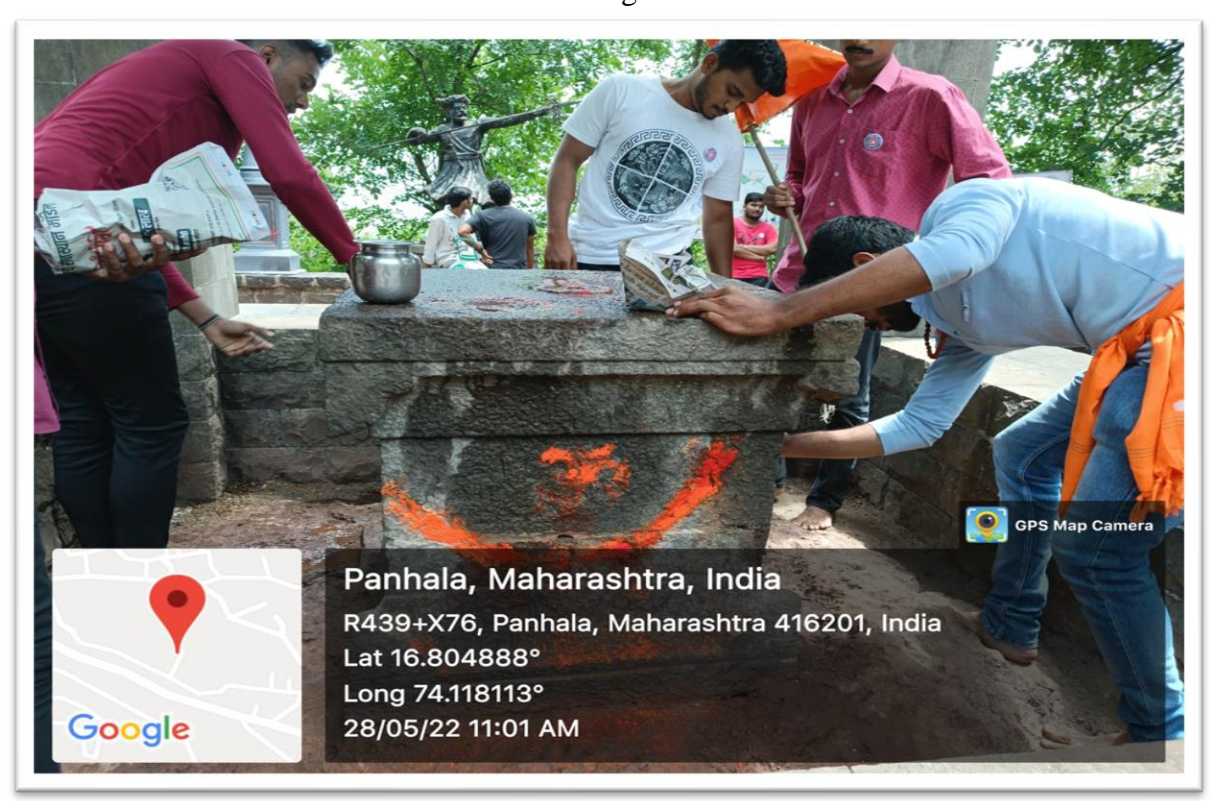
NSS Volunteers Cleaning at Samadhi Parisar Nebapur Panahala.