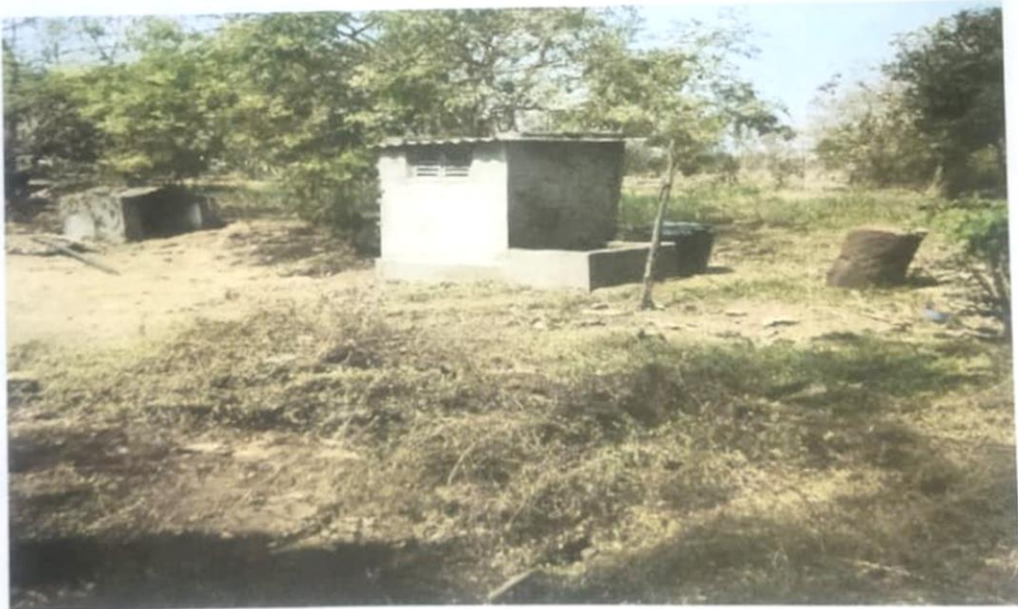
Photos-Biogas Plant at Kandalgaon Kolhapur