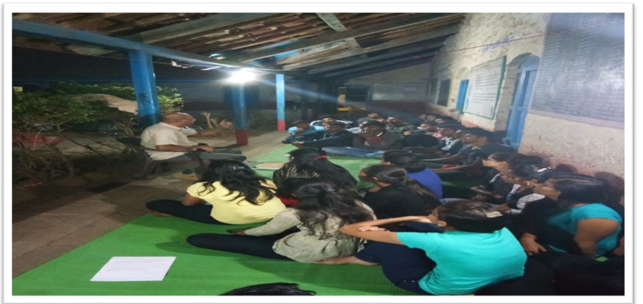
Audience-All NSS. Volunteers Attending Lecture.