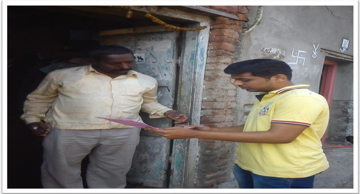
NSS Volunteers Surveying & Collecting data from Villagers.

Outcome of Activity : this survey helped Gram panchayat Authority to collect data of all villagers in order to convey various instructions on their mobile phones. Also come to know about problems of villagers.