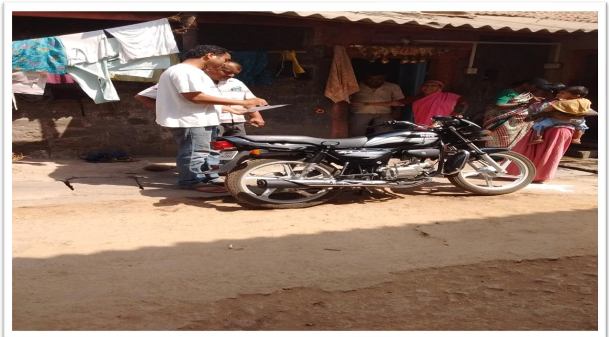
Collection of Information during Survey NSS by Volunteers.