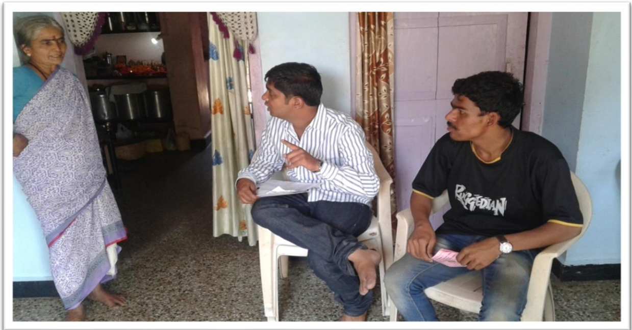
Survey Related to Mobile No&. Adhar Card Etc. Done by NSS Volunteers.