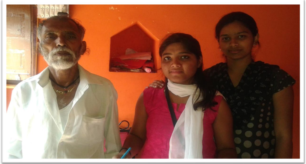
Survey Related to Mobile No&. Adhar Card Etc. Done by NSS Volunteers.