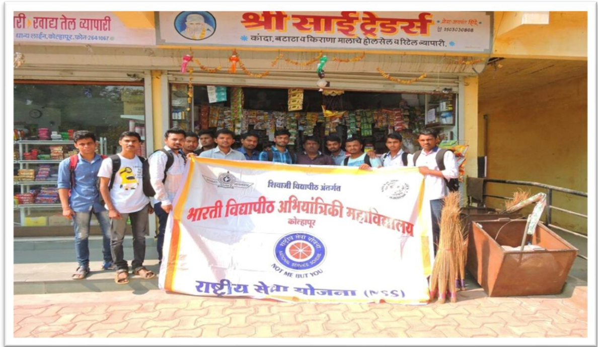
NSS Volunteers at R.K.Nagar during cash transaction awareness