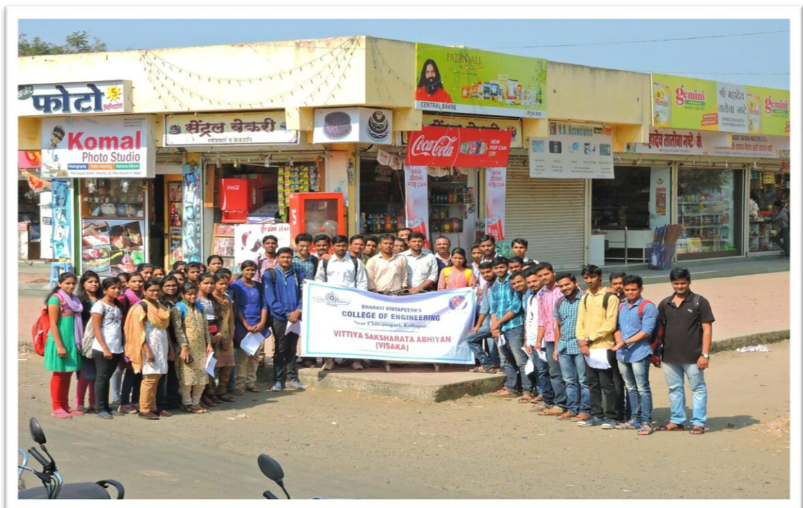
• NSS Volunteers at R.K.Nagar -Market place for cashless transaction awareness