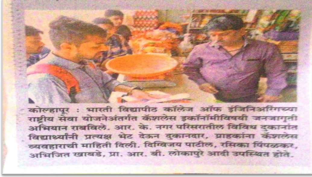
News of Activity in Daily, 'Sakal' Newspaper, Kolhapur.