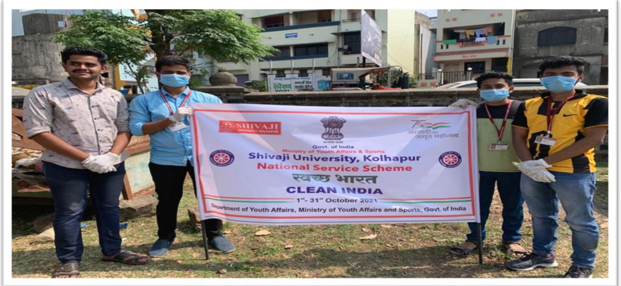
NSS Volunteers at Irani Khan (Lake) during clean India drive