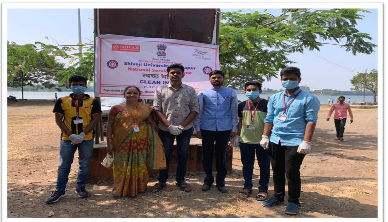
Rankala Lake View—After End of Drive.