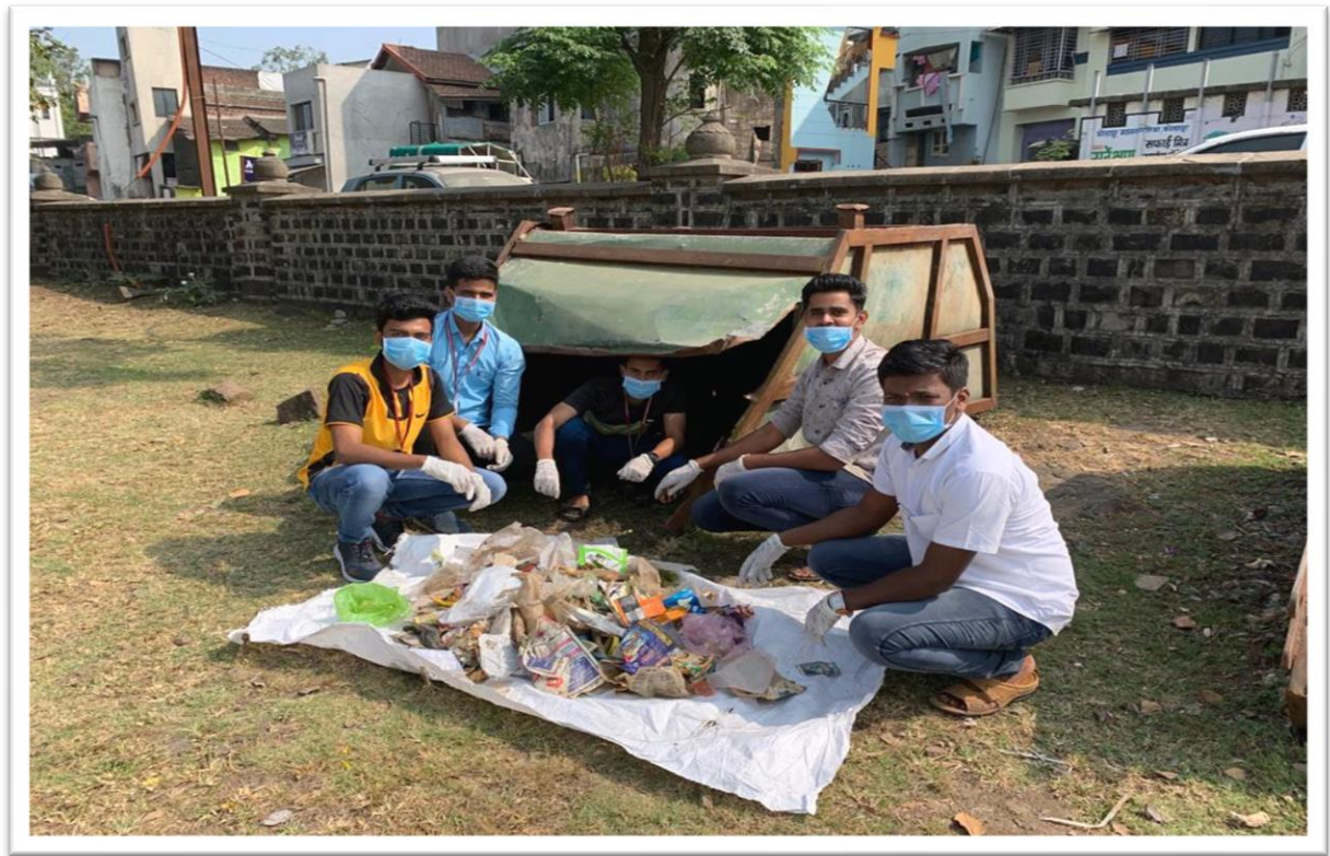
Plastic Waste Collection by NSS Volunteers