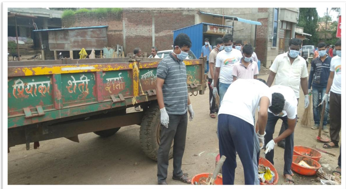
NSS TEAM-Collecting all type of waste from village affected due to heavy Flood.