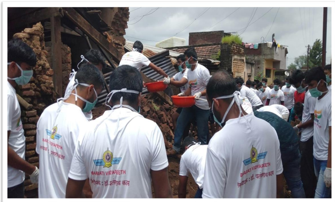
NSS Volunteers Collecting Flood Wastages & Cleaning From flood affected Houses.