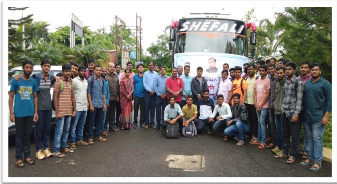
NSS Team-during Rehabilitation Work at Anklehop