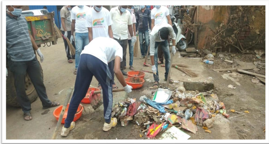
NSS volunteers collecting all wastages