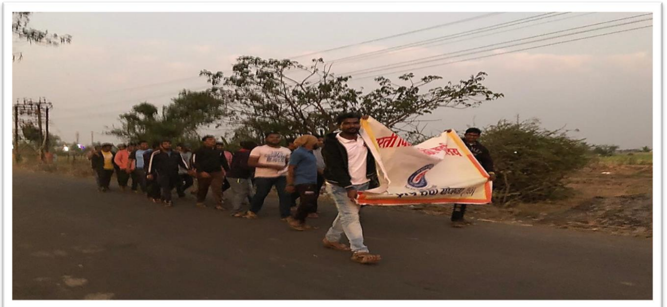
Volunteers for Rally in Mouje Sangaon.