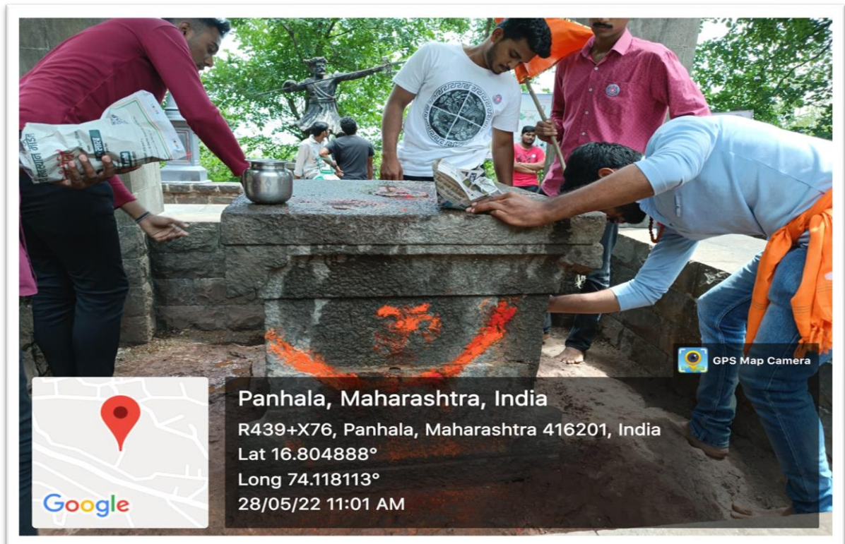
NSS Volunteers Cleaning at Samadhi Parisar Nebapur Panahala.