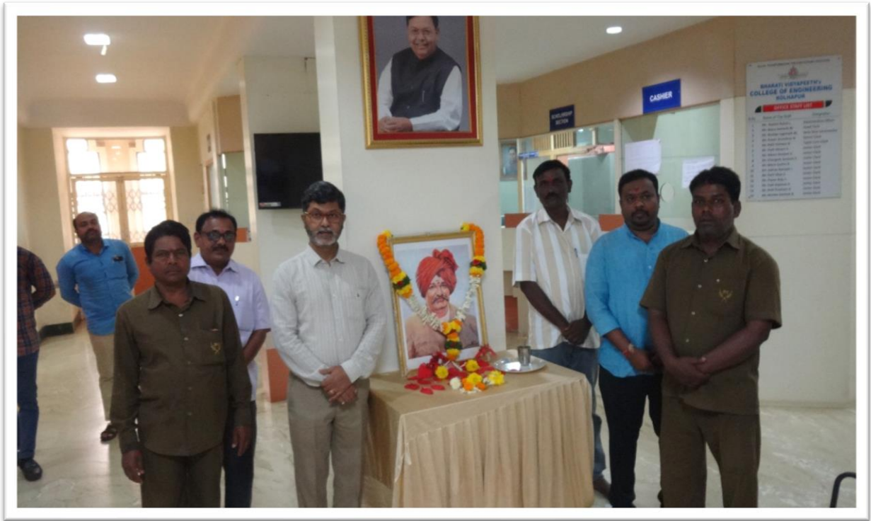
100 Year's 100 Seconds of Tribute for Lokraj Rajarshi Chhatrapati Shahu Maharaj