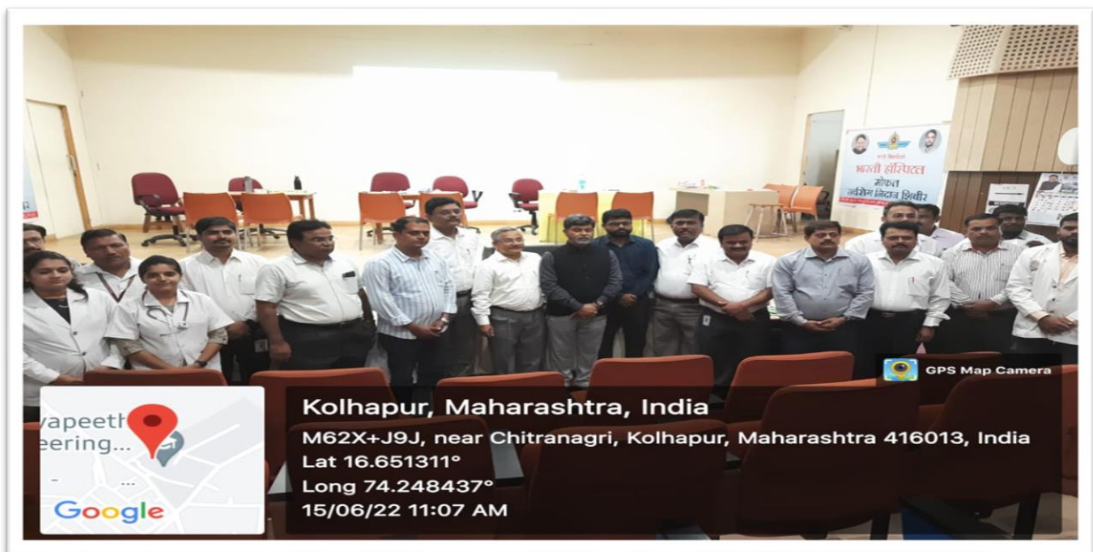
Teaching Faculty and Non-Teaching Faculty during Health Check-Up Camp