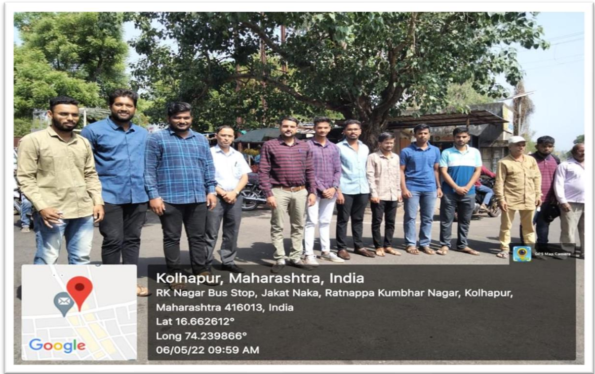
NSS Volunteers Participated at R.K. Nagar during 100 Seconds Tribute for Lokraja Rajarshi Chhatrapati Shahu Maharaj