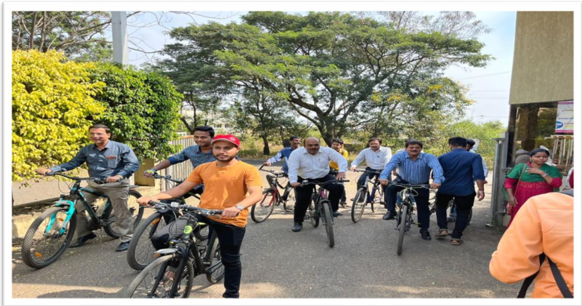
Participants of Teaching and Non-Teaching during No Vehicle Day.