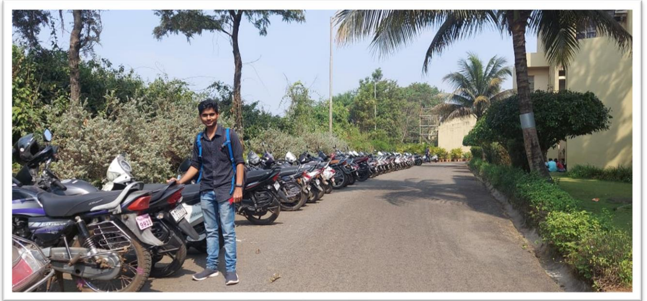
NSS Volunteers guiding all members and maintaining Parking Discipline.