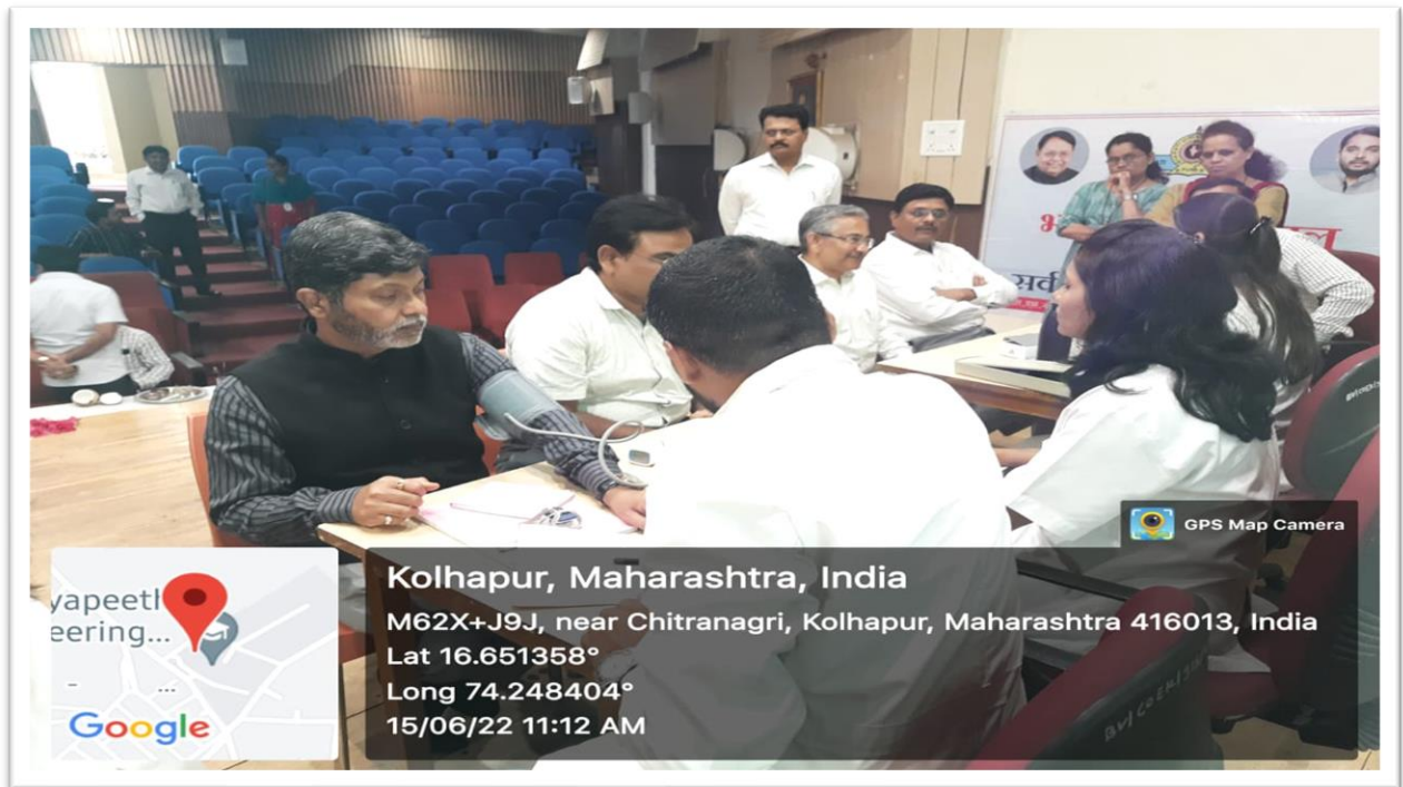
Principal and faculty during Health checkup camp by Bharati Hospital.