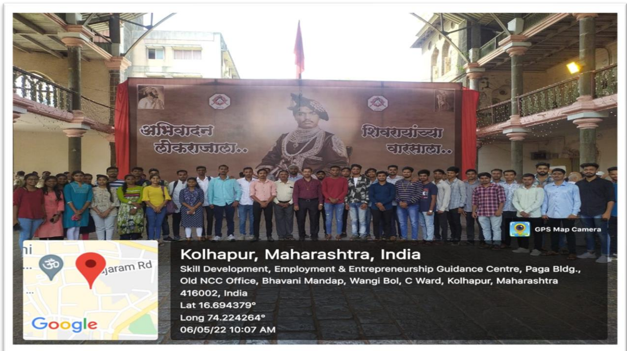
NSS Volunteers & NSS Coordinator with Staff Members at Bahvani Mandap, Kolhapur.