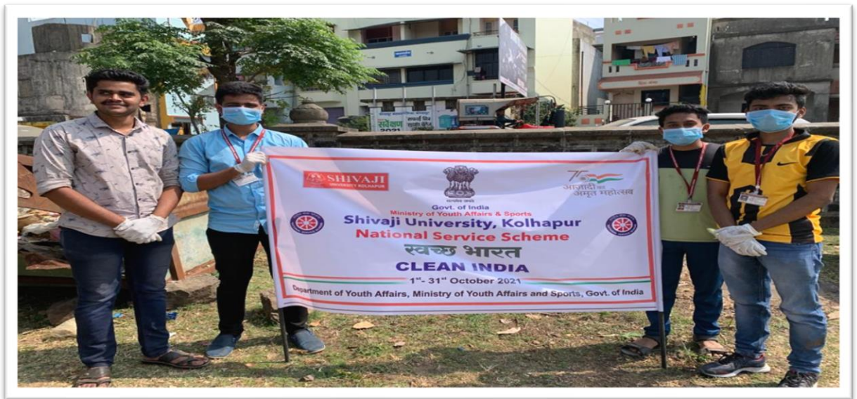
NSS Volunteers at Irani Khan (Lake) during clean India drive