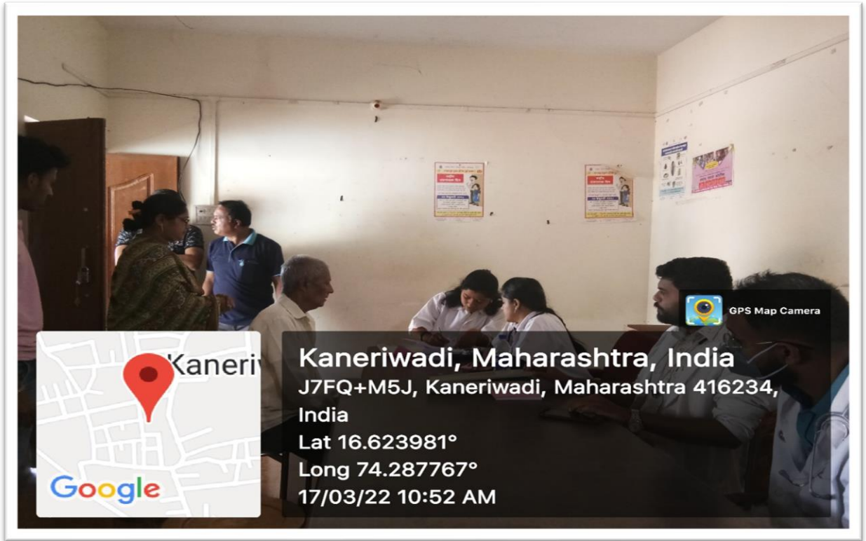
Doctors conducting free health check-up camp