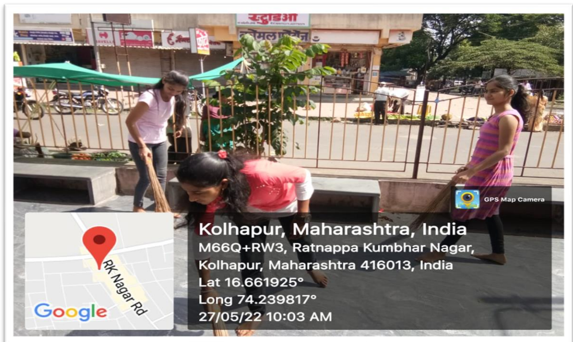
NSS Volunteers during Cleaning Temple & Road Area