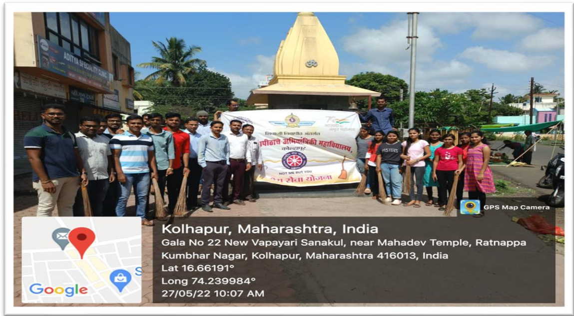
Participated Staff & NSS Volunteers during Cleanliness Drive