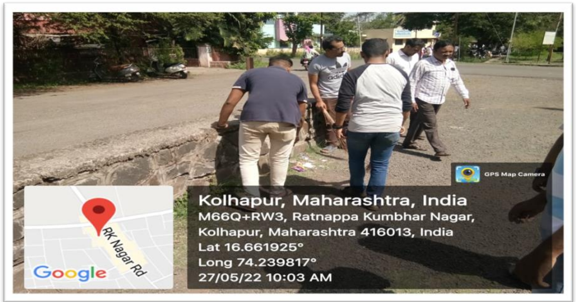
NSS Volunteers collecting plastic waste during Cleanliness Drive