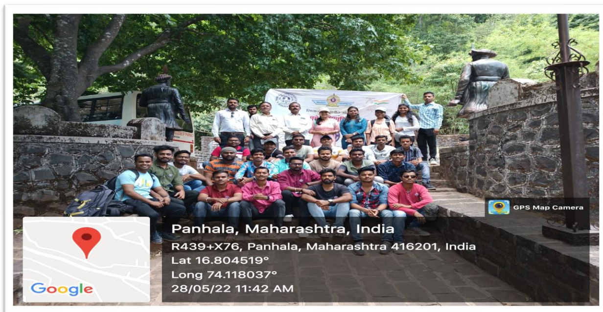
Group Photo-Participants NSS Volunteers