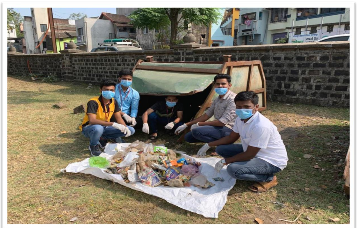
Plastic Waste Collection by NSS Volunteers