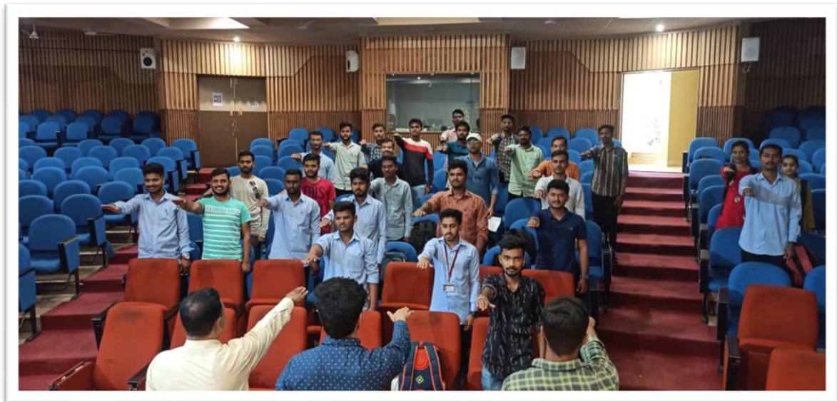
NSS Volunteers taking Oath on occasion of Constitution Day