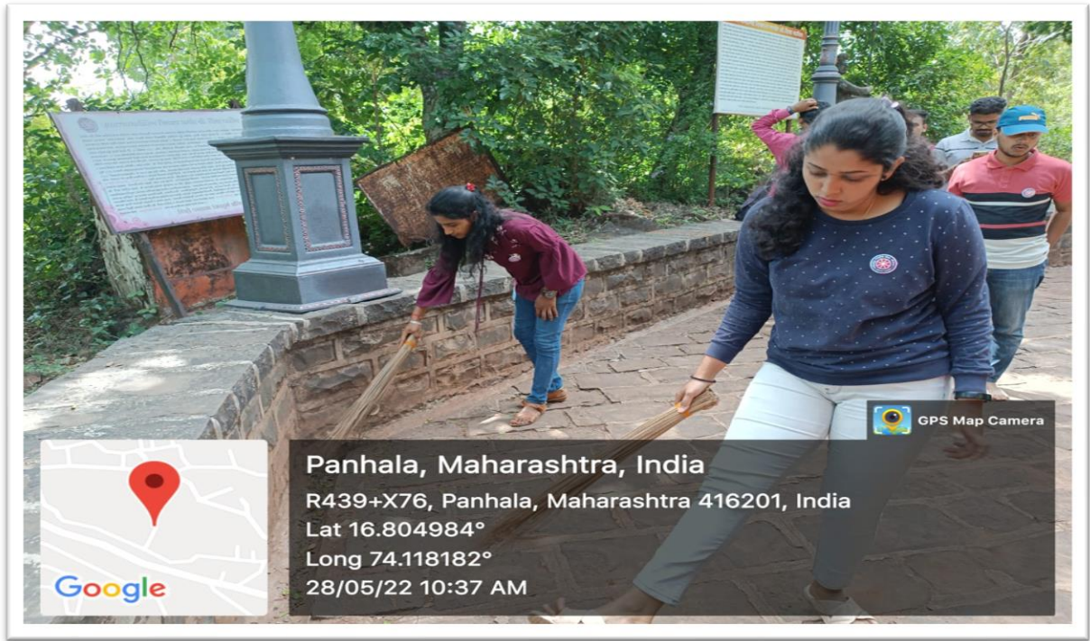
NSS Volunteers-Cleaning at Samadhi Parisar.