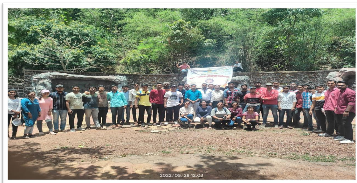
NSS Volunteers at Samadhi Parisar at Nebapur Panahala.