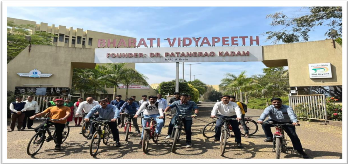
Celebration of No vehicle Day at Institute