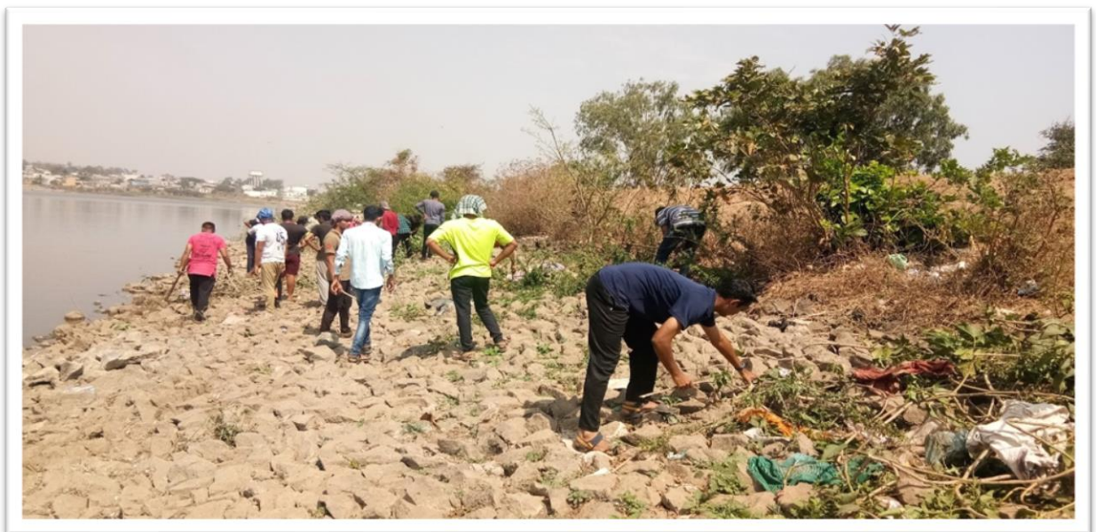
NSS volunteers cutting garwel & cleaning near lakeside