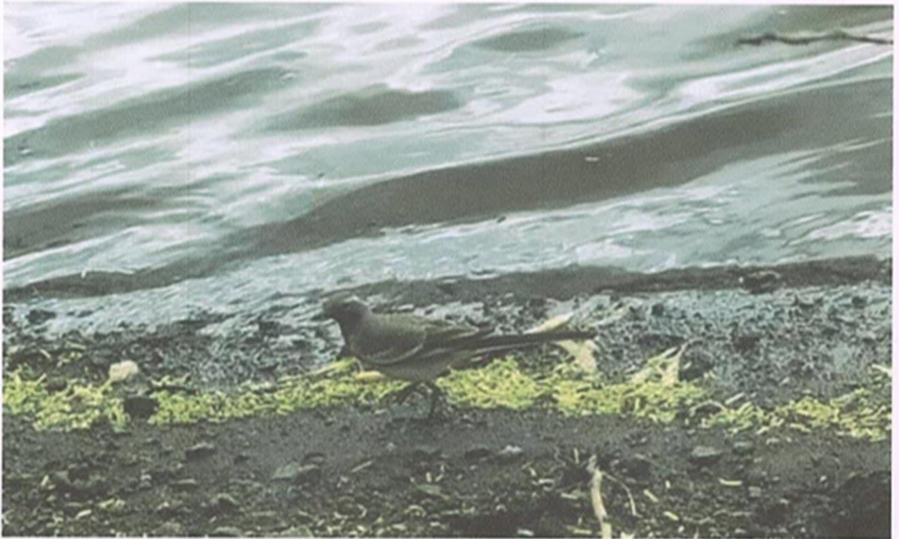
Animals observed near Pond.

The pond consists of variety of small fishes, small prawns, lata fish, toad, frog, tadpole, snail, leech, crab, checkered kill back snake, etc. In winter season the pond gets full with various types of birds mainly the migrated bird species. Differ from that the local bird species like Little Egret, Ducks, Geese, Swans, White throated Kingfisher, Red wattled lapwing, Purple heron, Painted Stork, etc. are found around this ponds area.