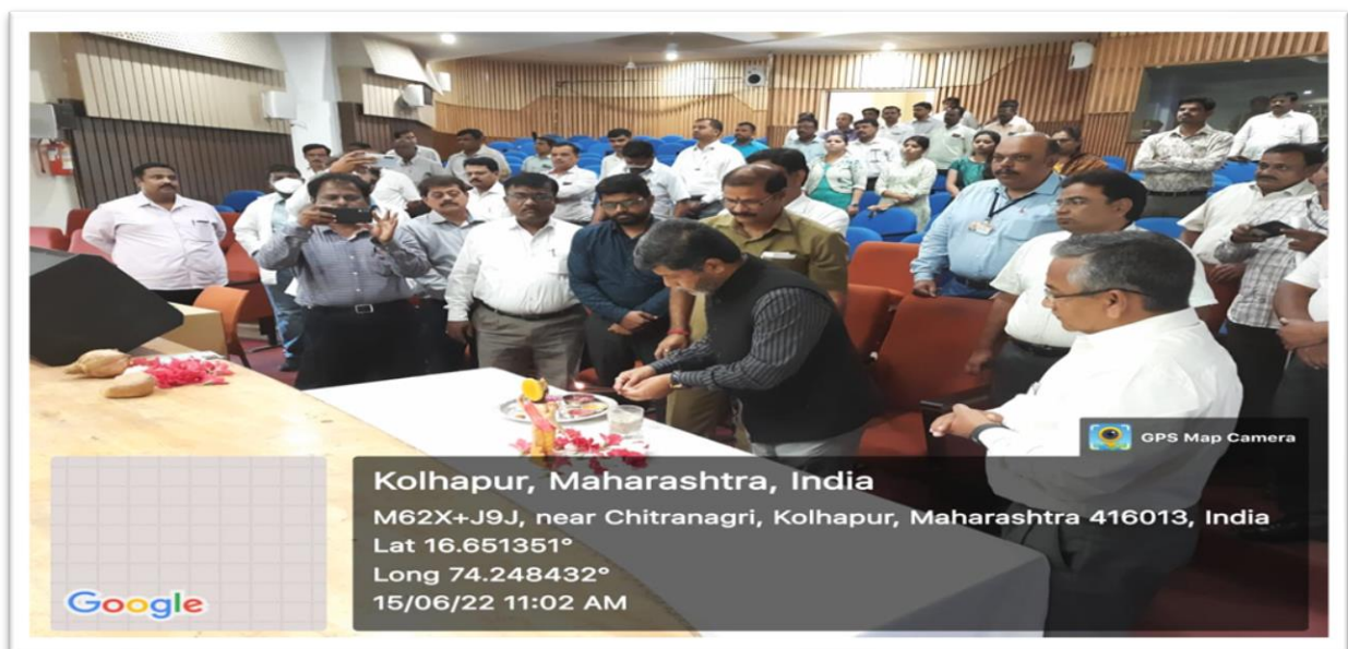
Inauguration of Health Checkup Camp.