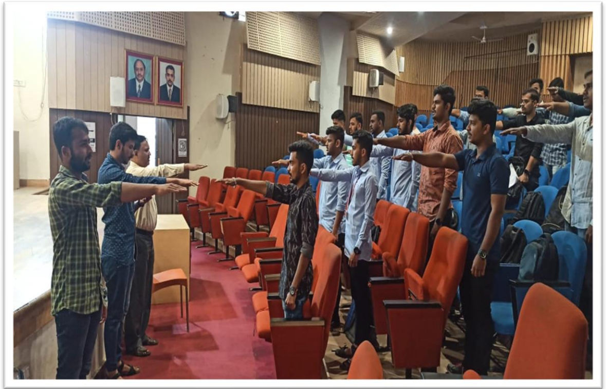
NSS Volunteers taking Oath on occasion of Constitution Day