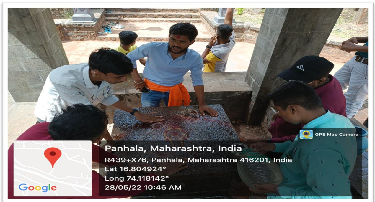
NSS Volunteers during Cleanliness Drive at Veer Shiva Kashid Samadhi, Nebapur Panhala