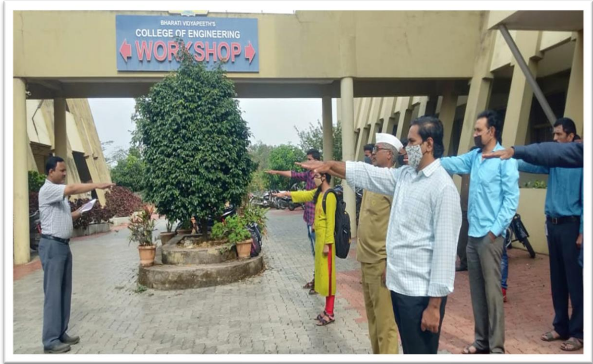
Harit Shapth (oath) by Teaching Staff & NSS Volunteers.