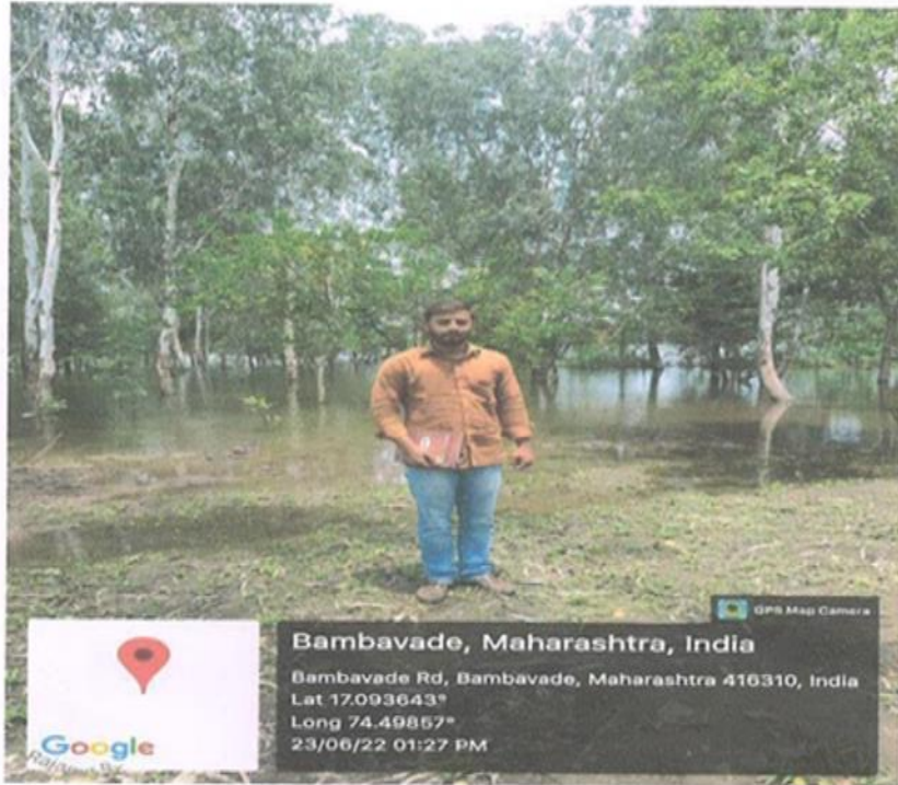
Students taking Observation about Eco system during project