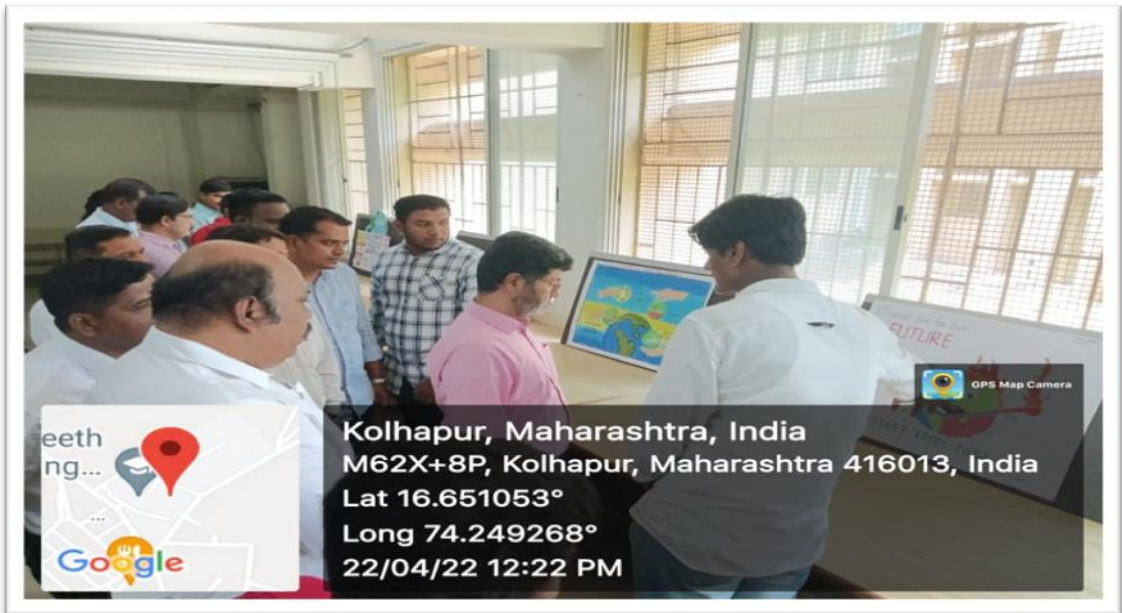
Poster presentation on occasion of world earth day 2022