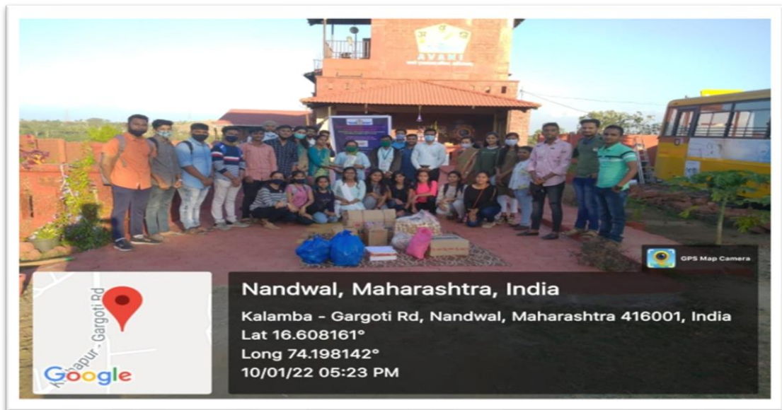
Organization of Social Activity at AVANI Sanstha