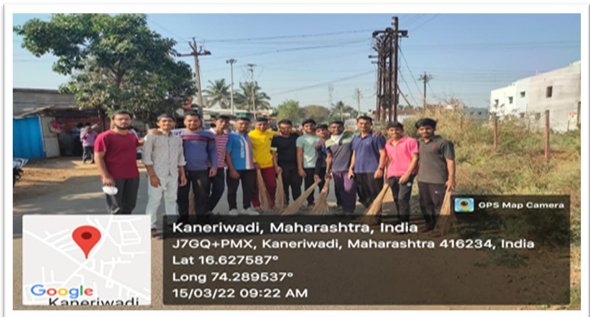
NSS Volunteers Cleaning road from NH-4 highway to Kaneriwadi village