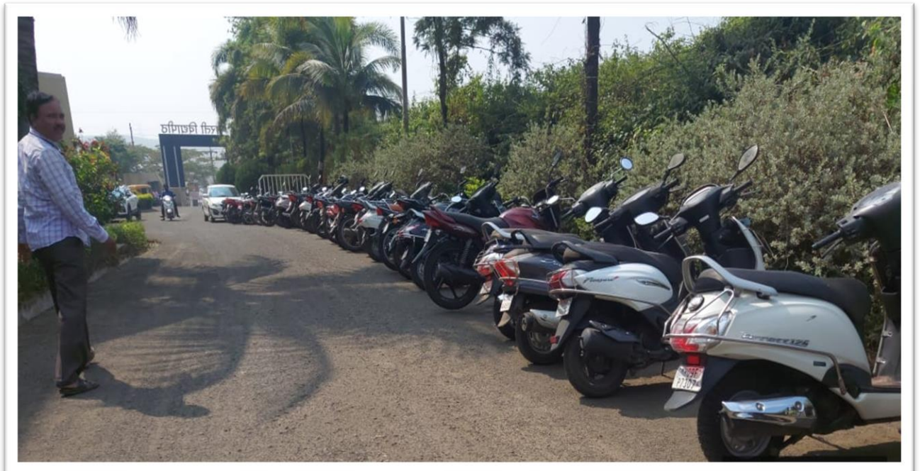
Parking discipline maintained In college by students in vehicle parking section