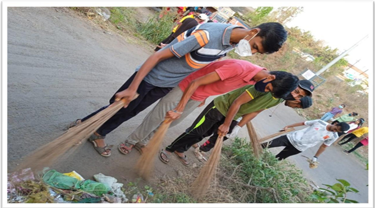
NSS volunteers cleaning roads of Kaneriwadi village