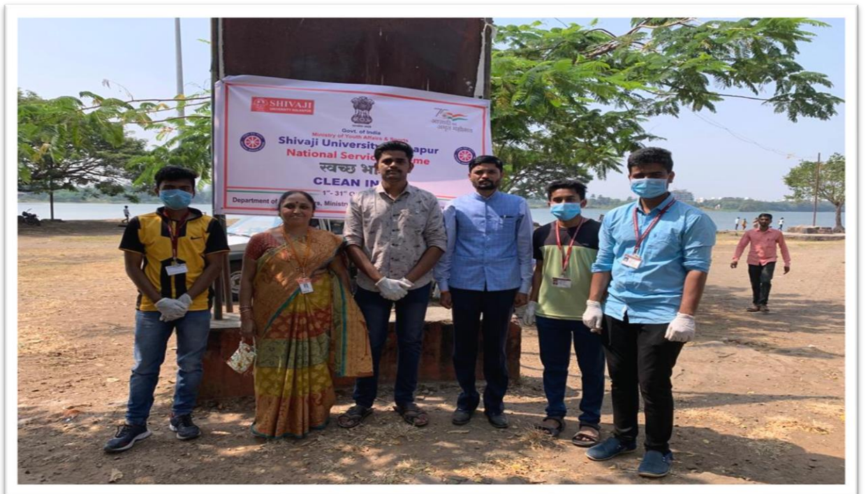
Rankala Lake View—After End of Drive.