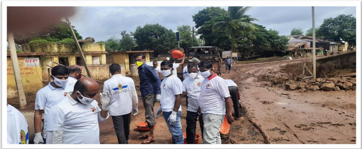
Non teaching staff Participated in Rehabilitation work at Anklekhop village.