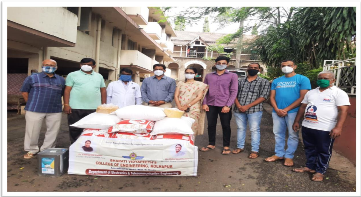
Grocery items donated at Sakal Covid center at Jain boarding Kolhapur