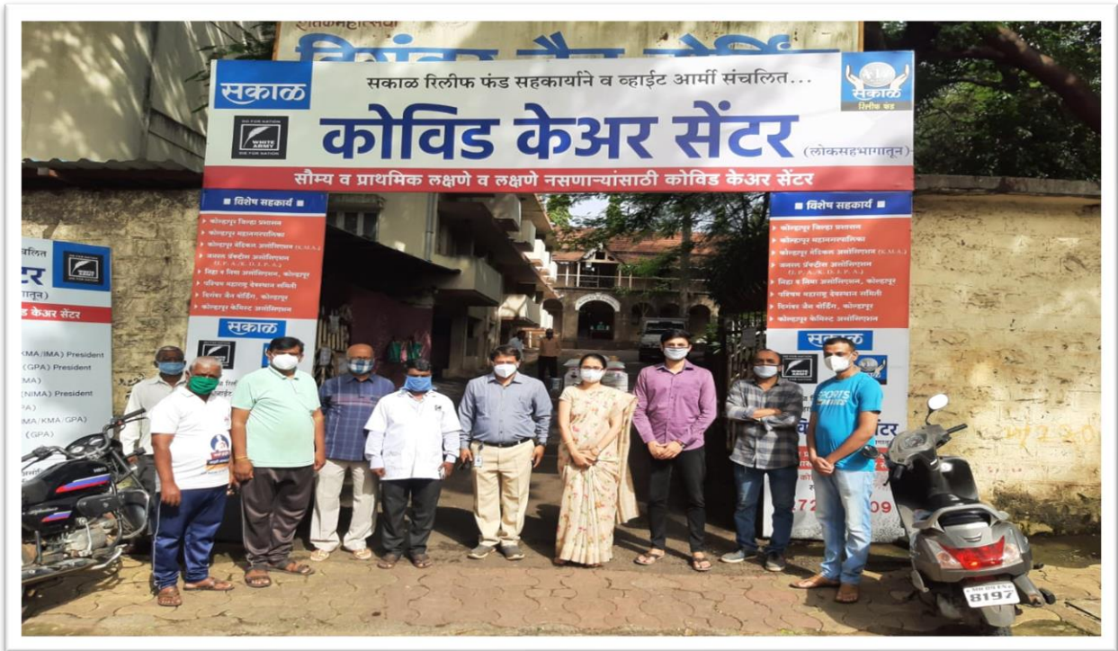
Donation of Grocery items at Covid center at Jain boarding Kolhapur by Faculty and students