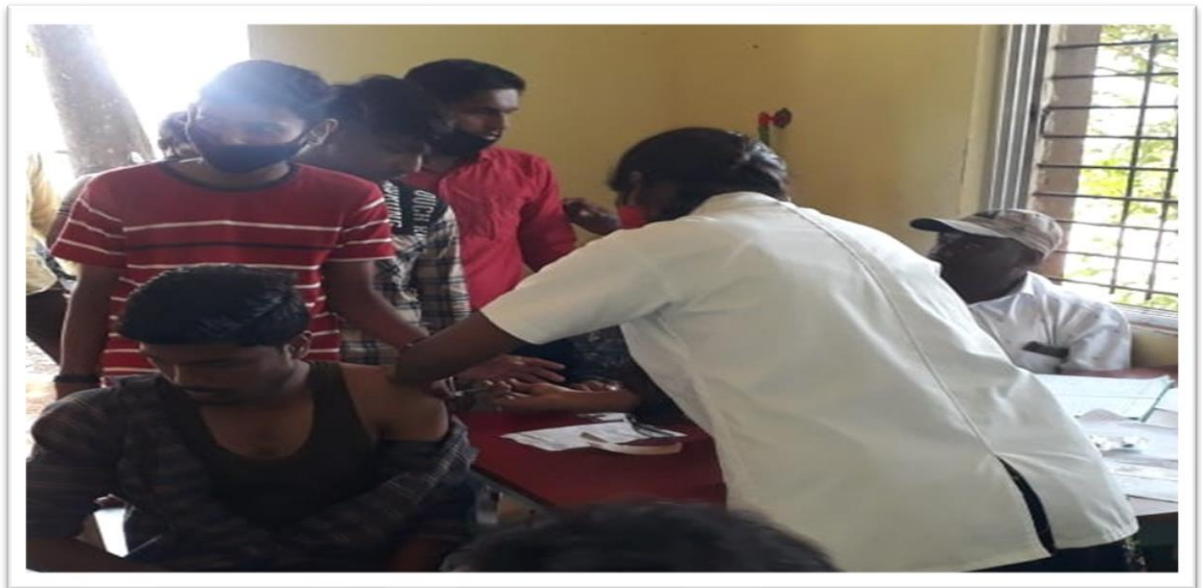
Covid Vaccination drive for college students in BVCOE campus