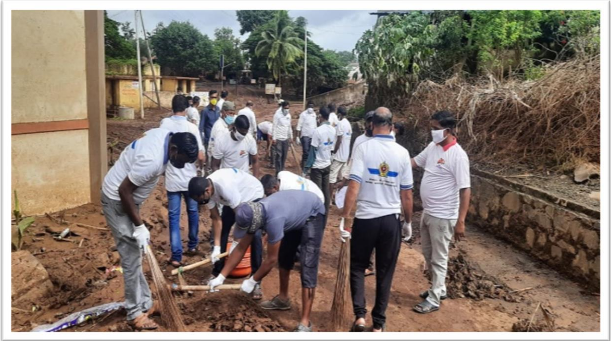
Cleaning of flood affected area in Ankalkhop