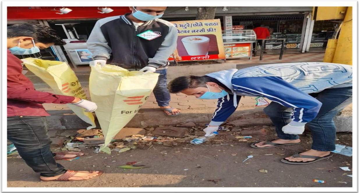
NSS Volunteers Collecting plastic waste on road