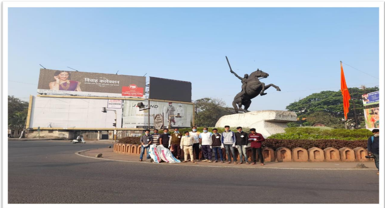
NSS Volunteers Collected Plastic Waste.