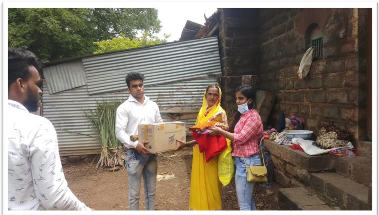
NSS Volunteers Kit Distribution to needy Family.