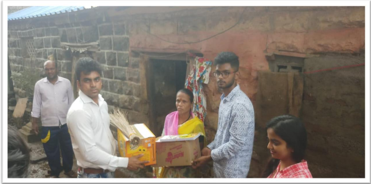
NSS Volunteers distributing kit to needy families.