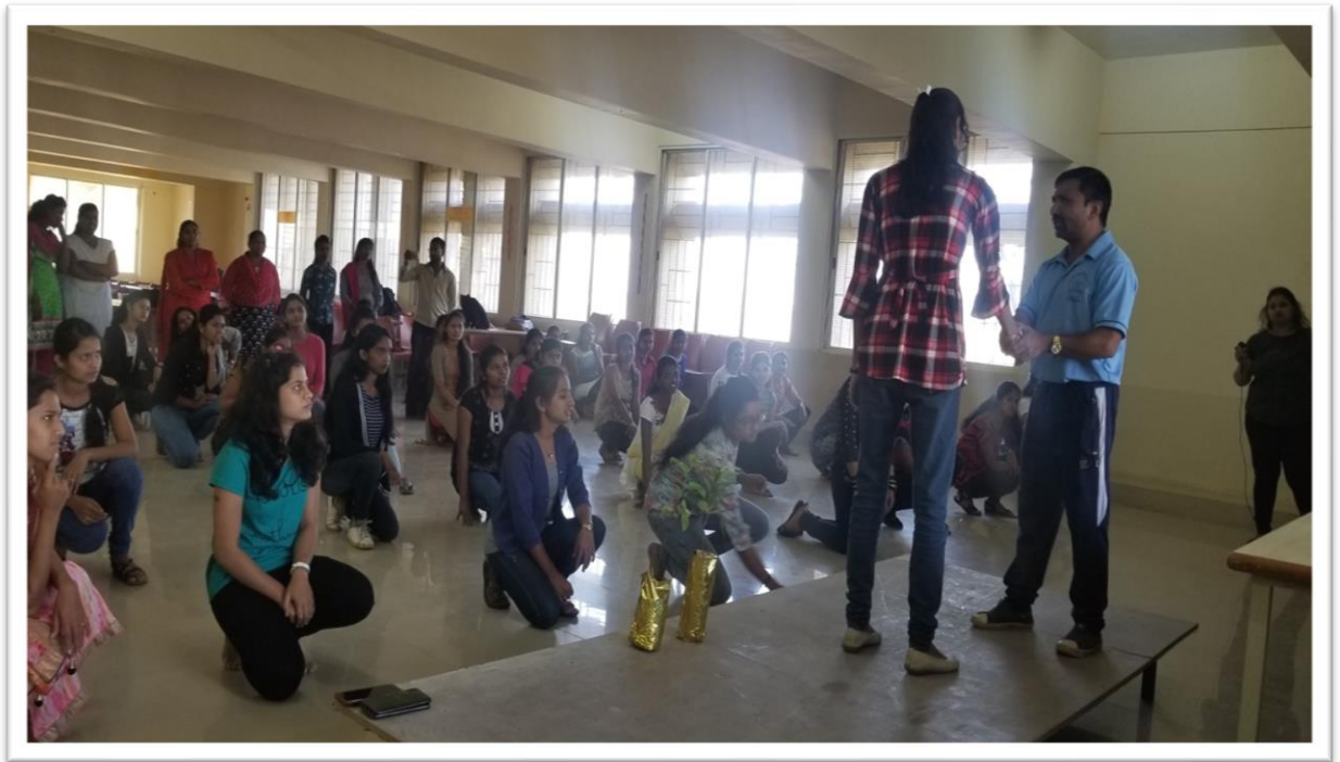
Demonstration of self-defence techniques by trainer