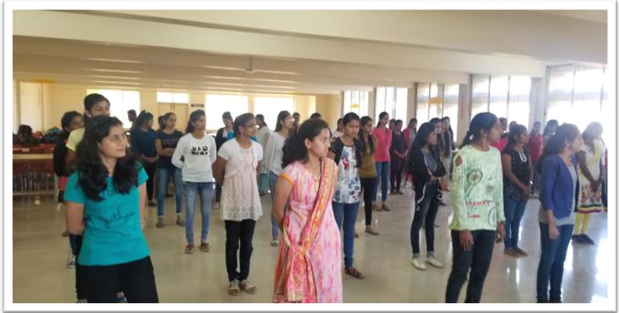
Students ready for learning Techniques of Self Defence activity.