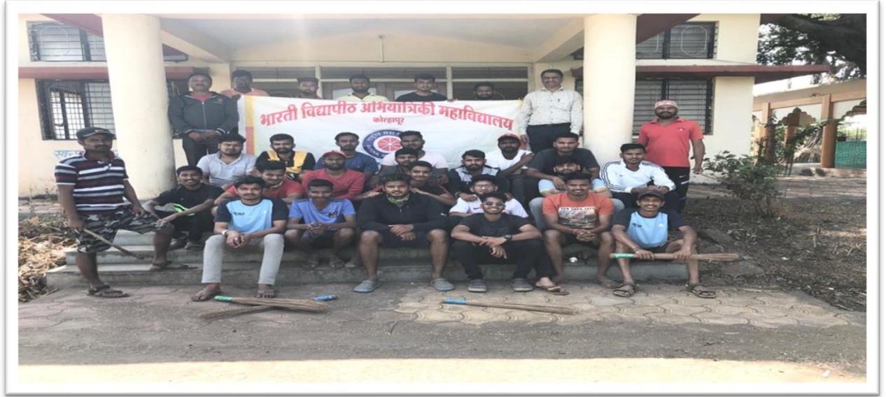
NSS UNIT after cleanness and plastic collection drive