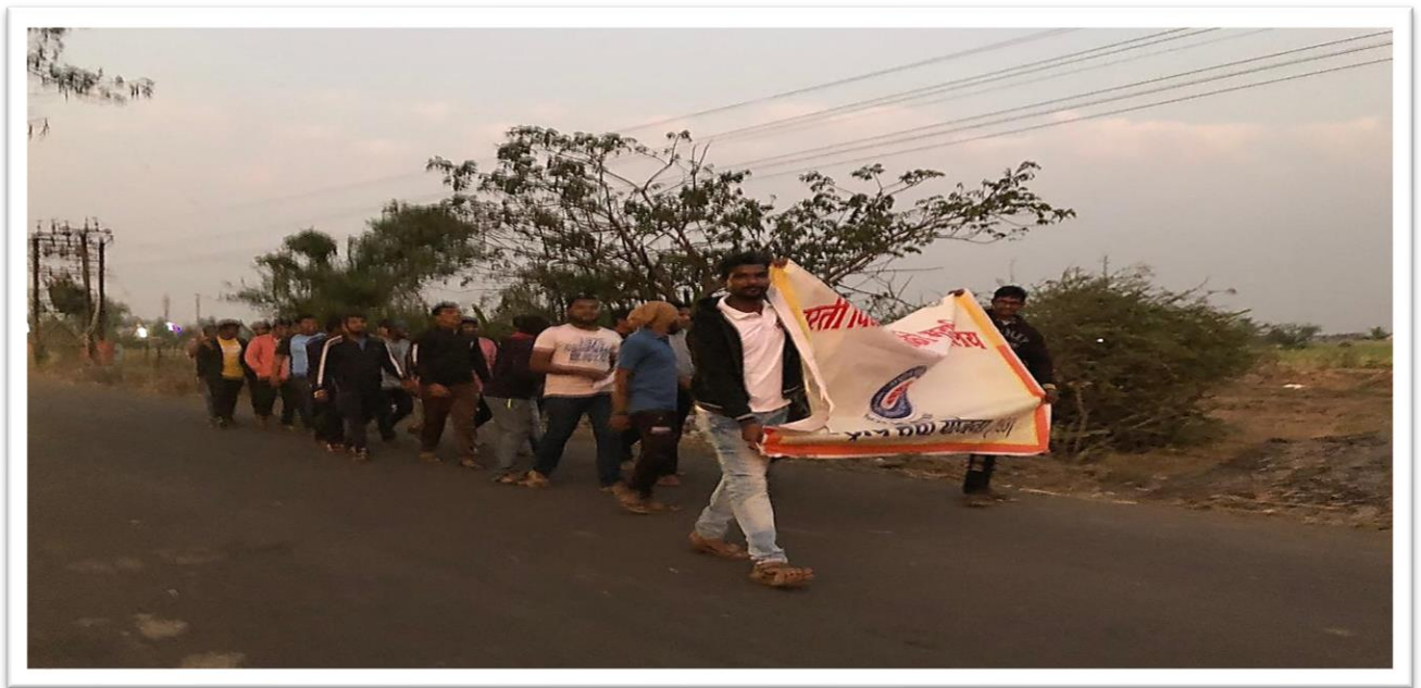
Volunteers for Rally in Mouje Sangaon.