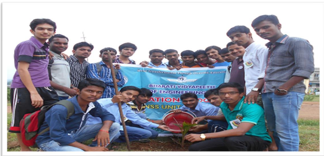
NSS Volunteers –Watering for Mango trees