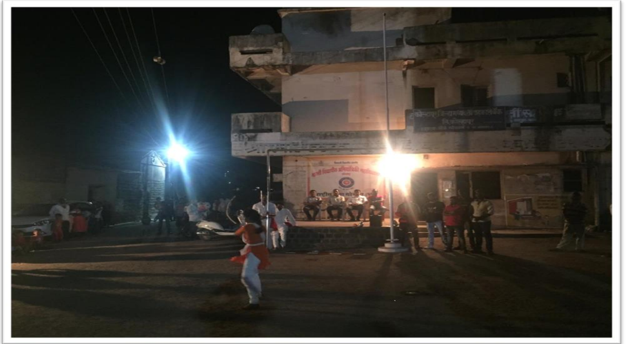
Students performing Self-defence activity.