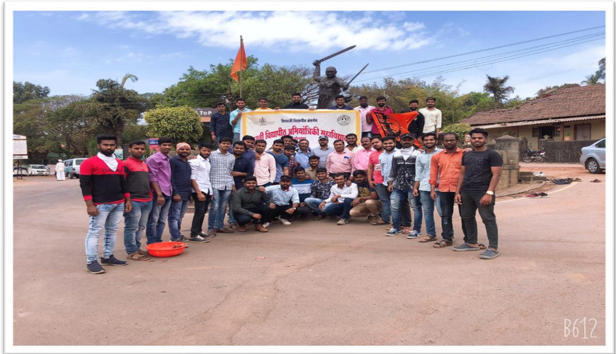
NSS volunteers participated in ``Swachhta Abhiyan`` at Panahala fort.