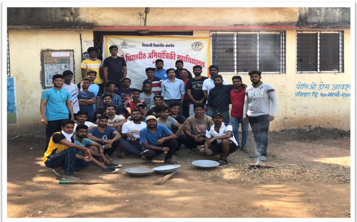
Gram Swachhata Abhiyan. –Near Z.P. School, Gutter Side Roads Etc.