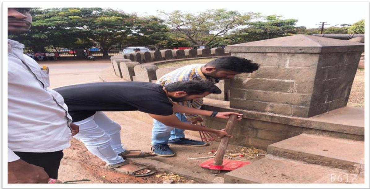
NSS volunteers participated conducting cleaning activity at Panahala fort.