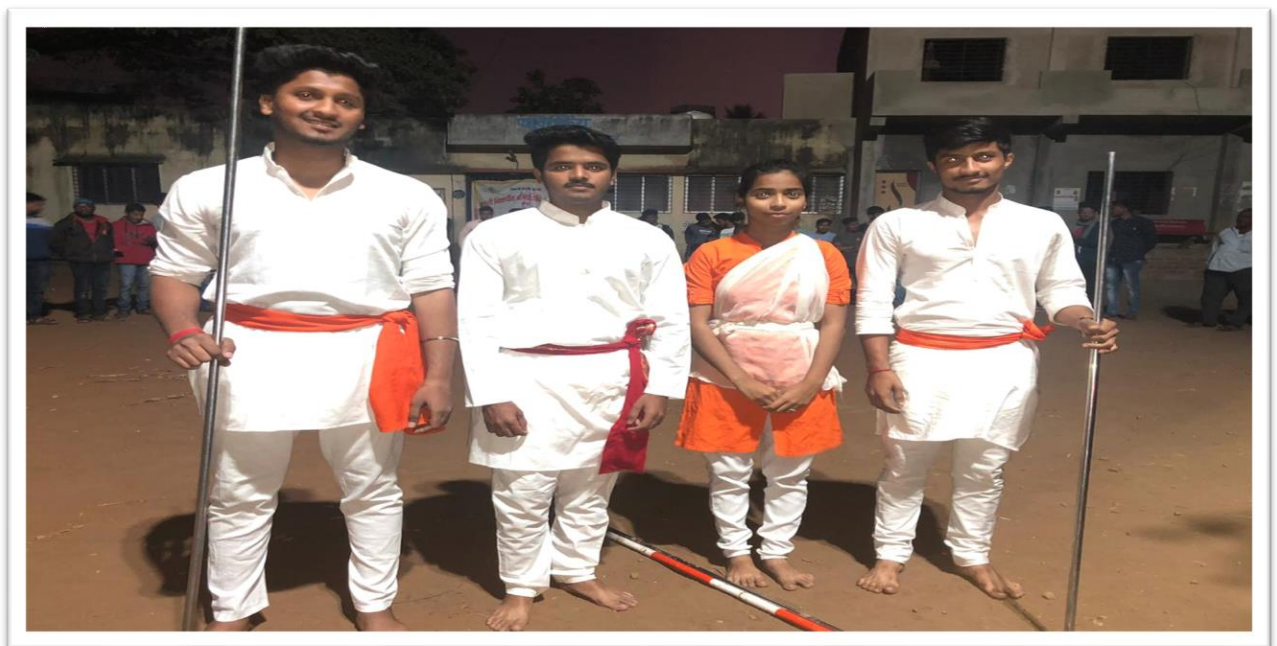
Ready for Performance of Defence Play.