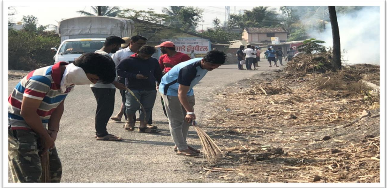
NSS Volunteers cleaning Roadside at Mouje Sangaon

NSS Volunteers worked for next day to clean Z.P. school areas. And village gutter side wastage cleaned, under the guidance of social worker Shri Nandkumar Patil so, and NSS Head R.B. Lokapure.