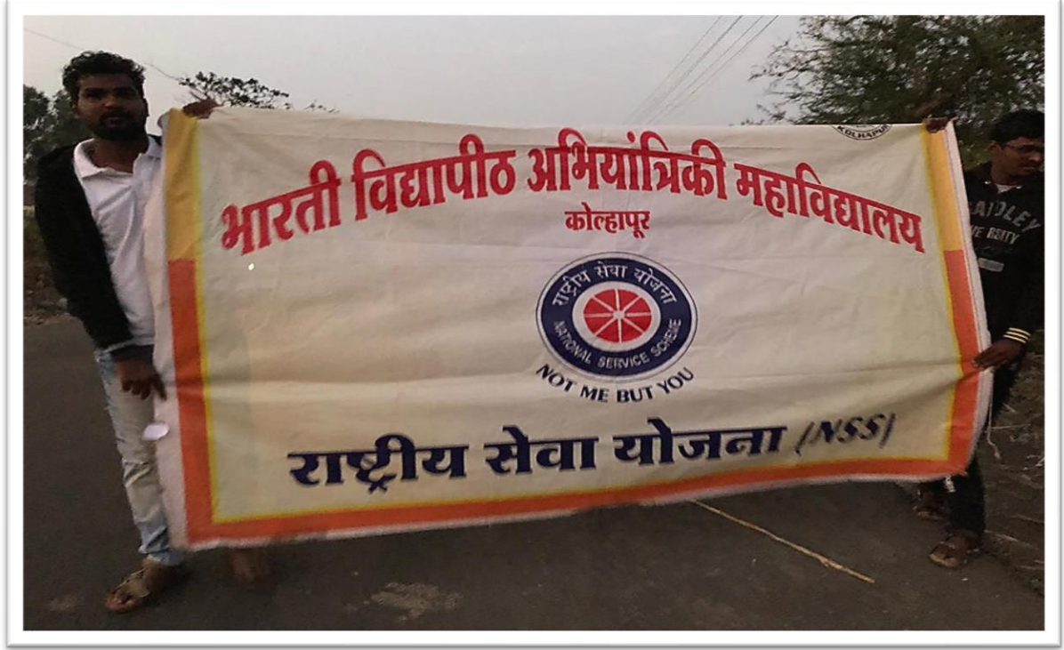
Rally at Mouje Sangaon