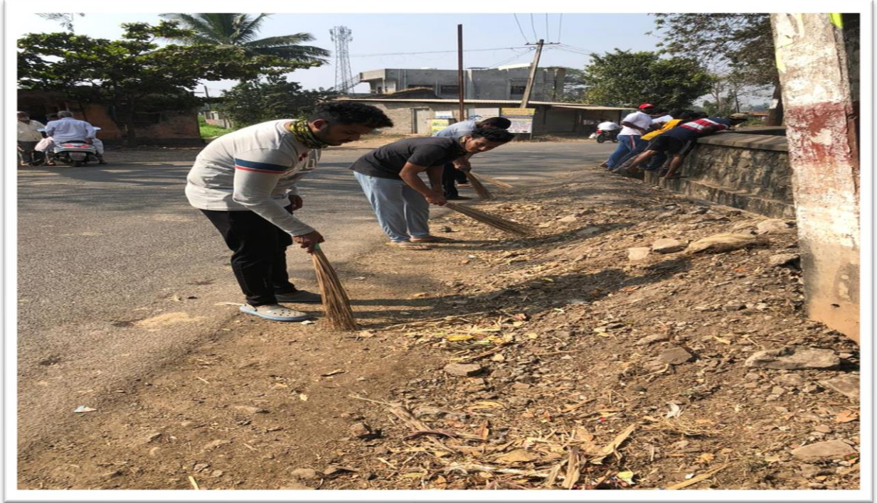
NSS Volunteers cleaning at Ashok Lake area.