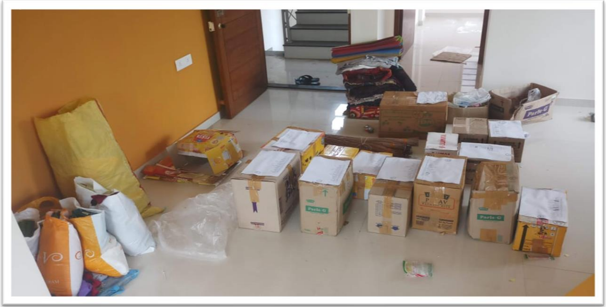
Preparation of kit-NSS Volunteers prepared kit containing essential food grains etc.