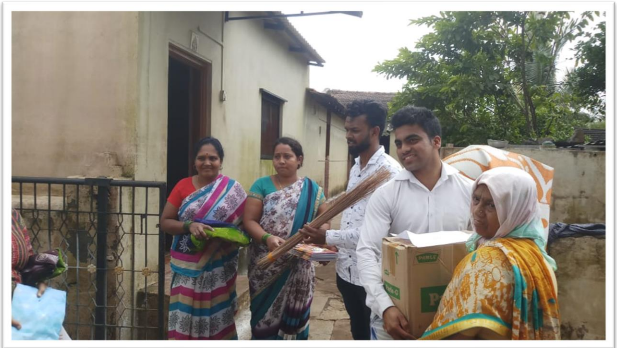
NSS. Volunteers –Distributing Kit in Kolhapur City for poor needy families.