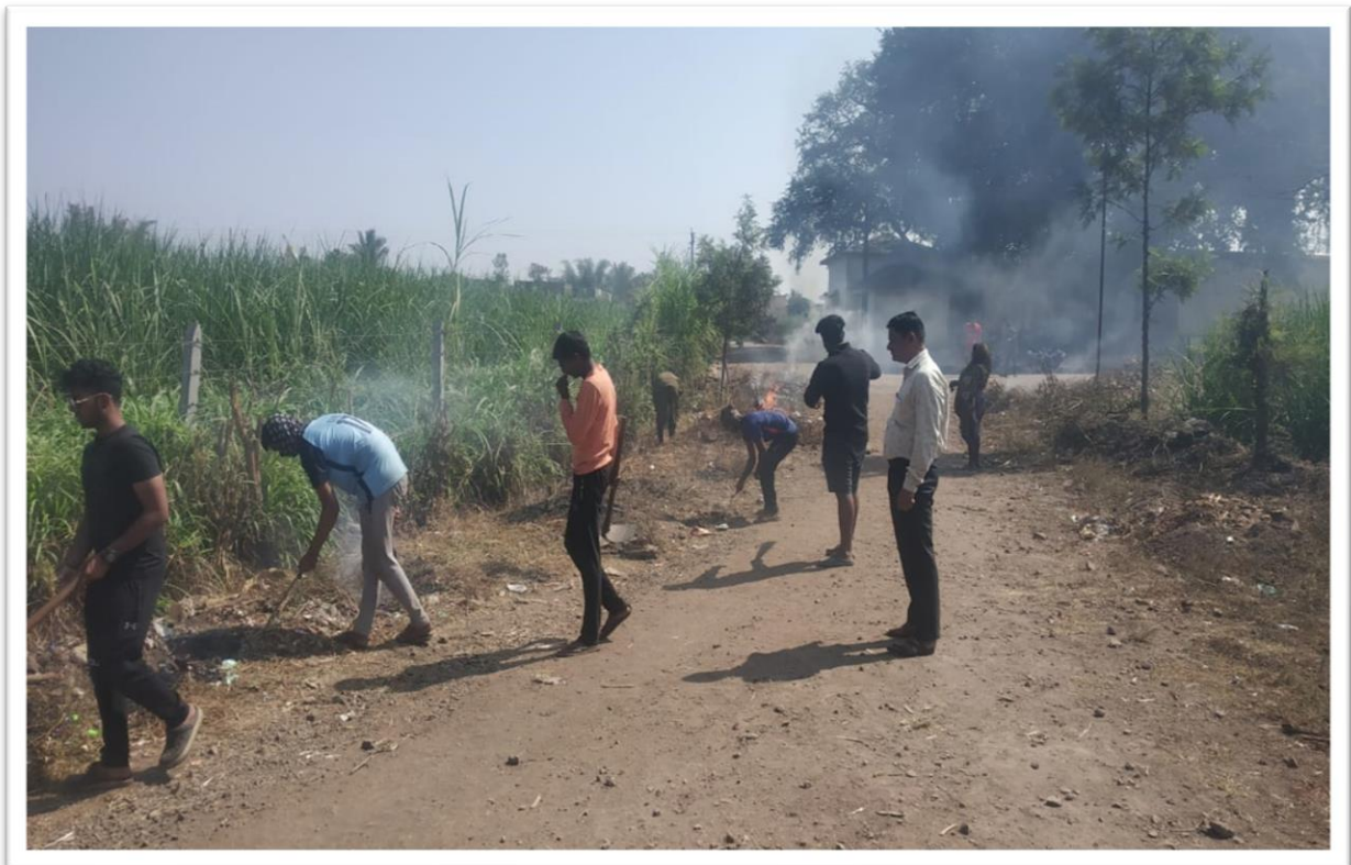
NSS Volunteers cleaning Roadside Area.