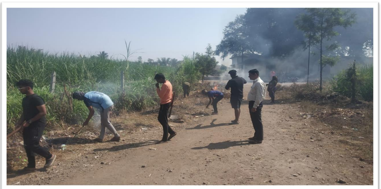
NSS Volunteers Cleaning and Collecting Plastic & Waste

During this camp all village roads cleaned by our volunteers but the Darga area where huge wastage and other unwanted materials is there so same collected and all areas is cleaned