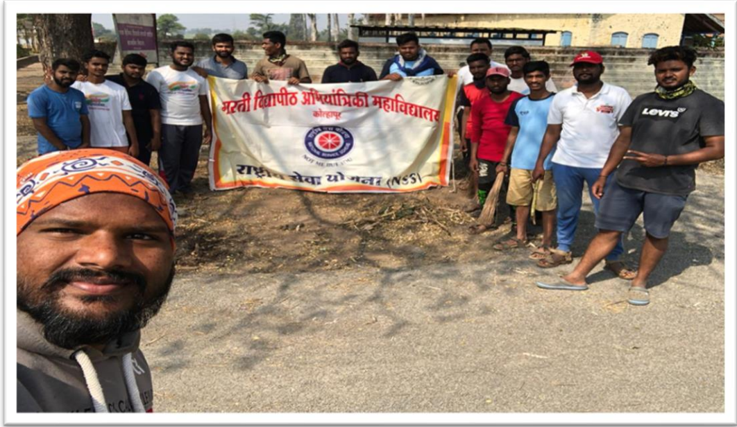
Group Photo-NSS Volunteers –Watering for Mango trees