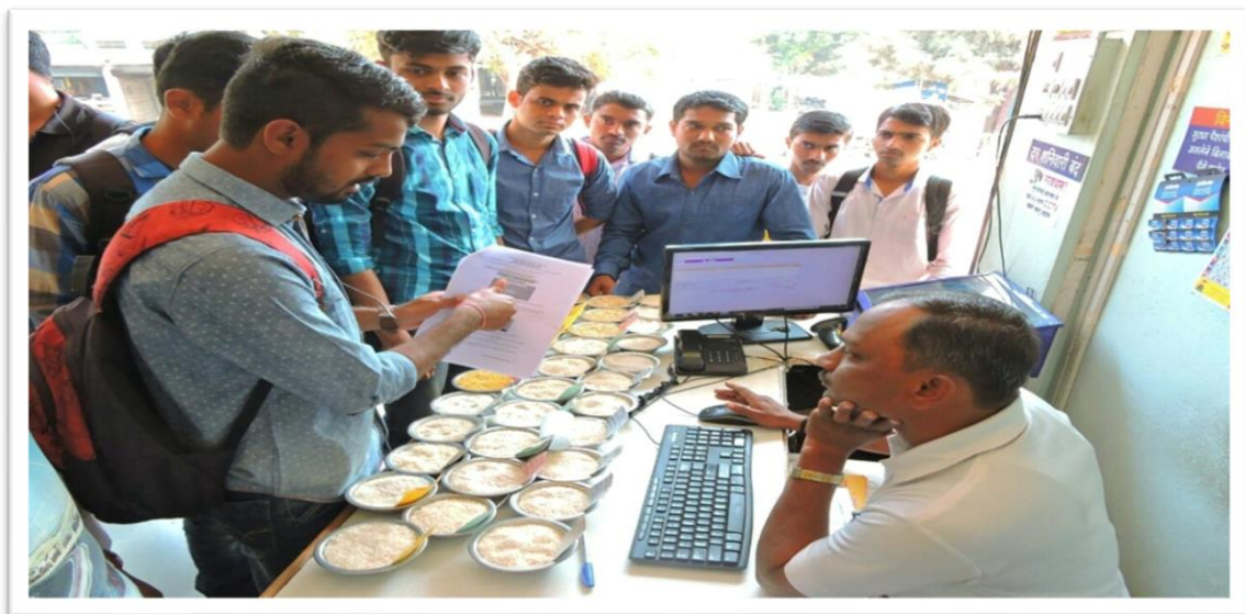
Information given to Shop Owner regarding Digital Payment.