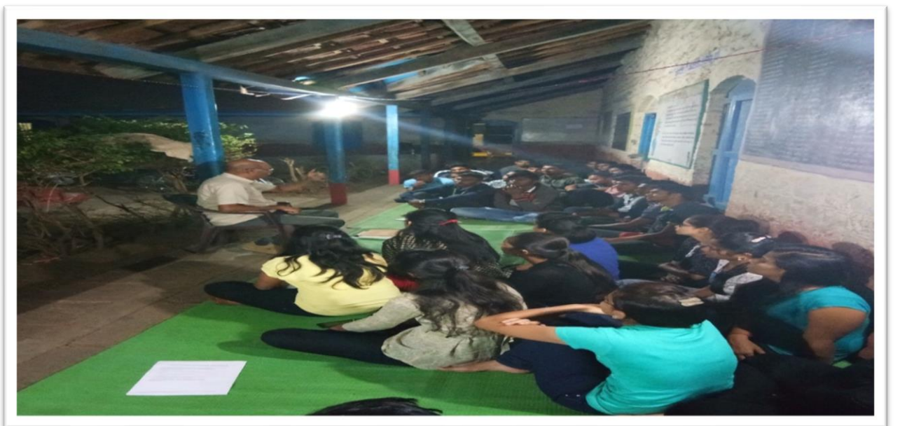
Audience-All NSS. Volunteers Attending Lecture.