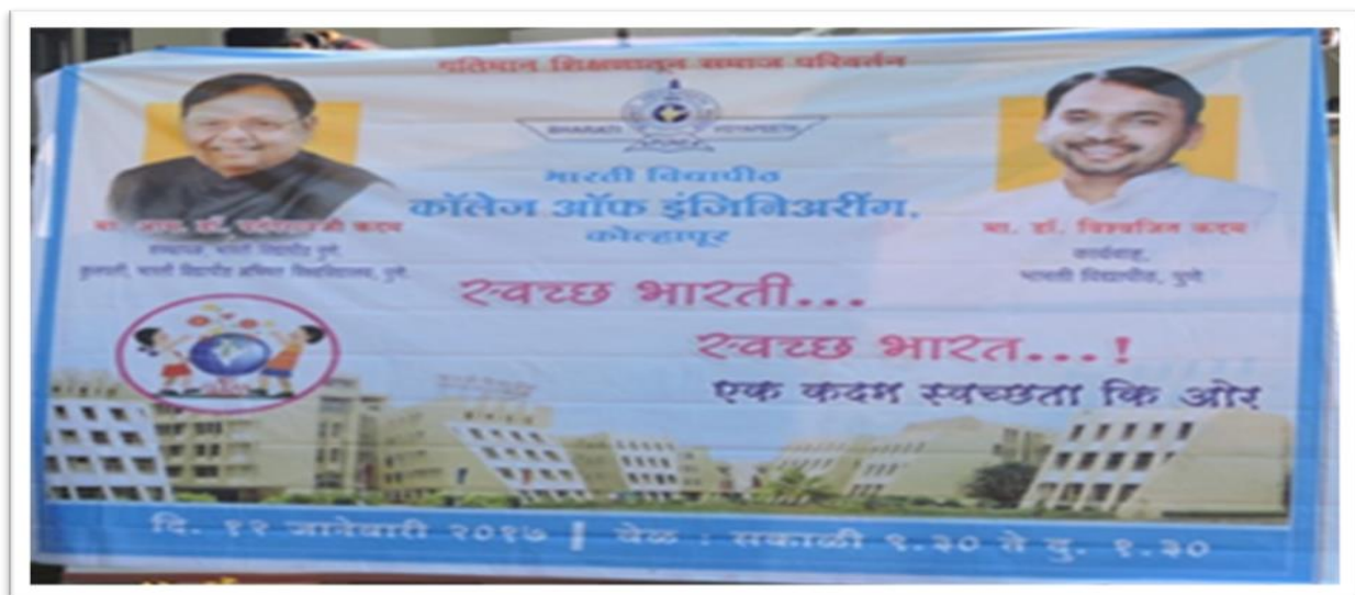
'Swachhata Abhiyan' at BVCOEK