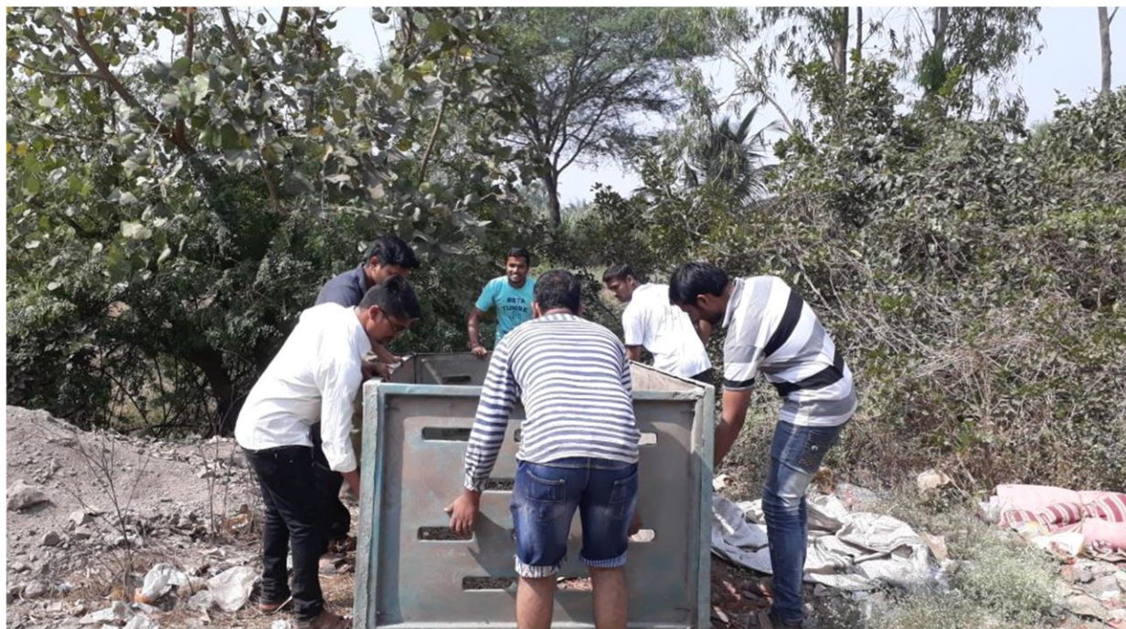
NSS. Volunteers from (Mechanical Branch)-Assembling & Fitting Box (Fiber Material) For Dumping Waste from Village.