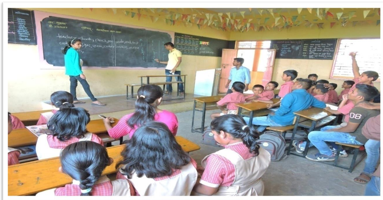
Teaching Lessons by NSS Volunteers.