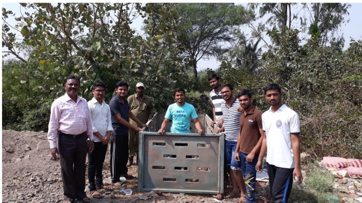
Assembly Complete-NSS Volunteers