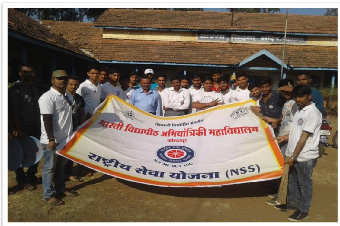
Group Photo-NSS Volunteers for Rally