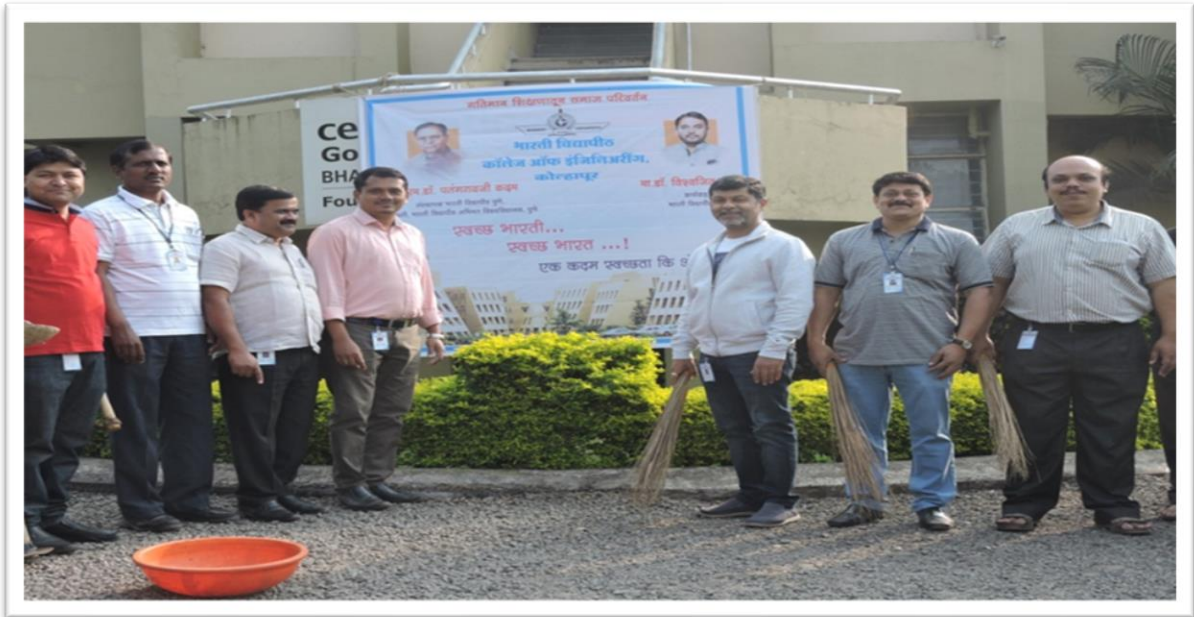
Swachhta Abhiyan at BVCOE.Kolhapur