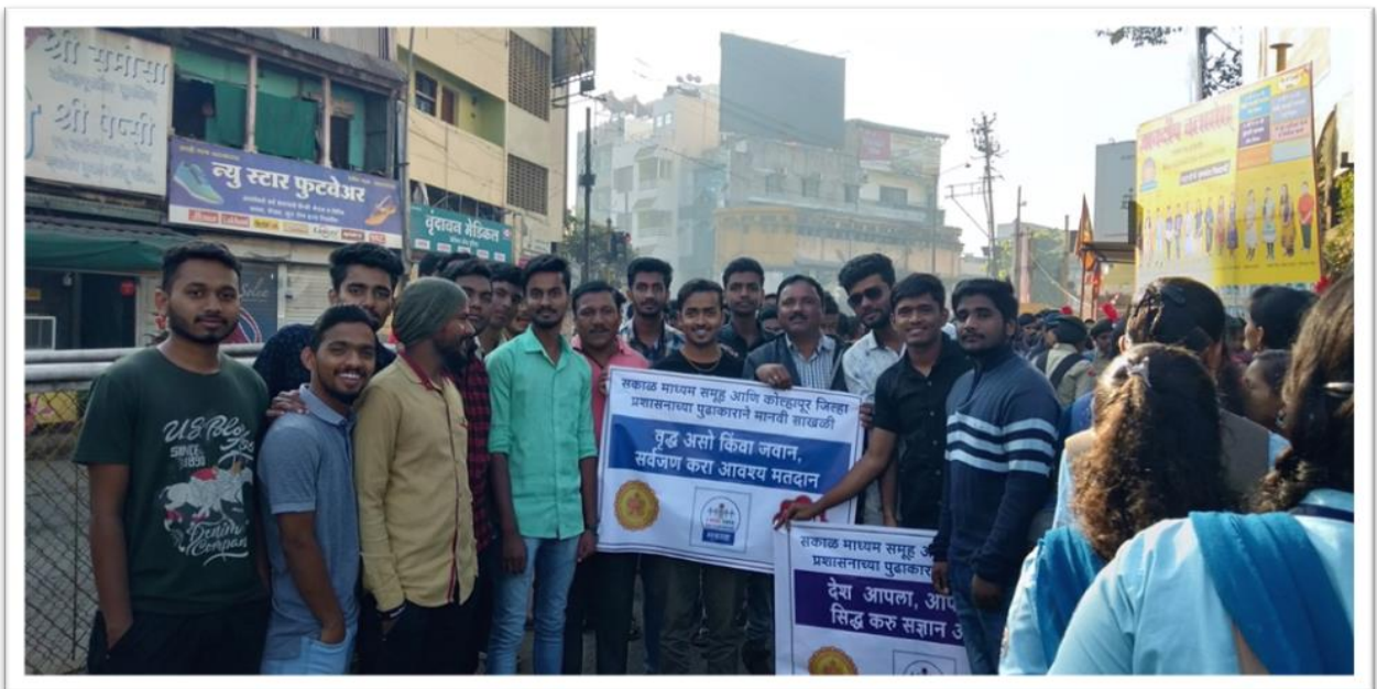
NSS Volunteers Participated in Voter's Day Rally.