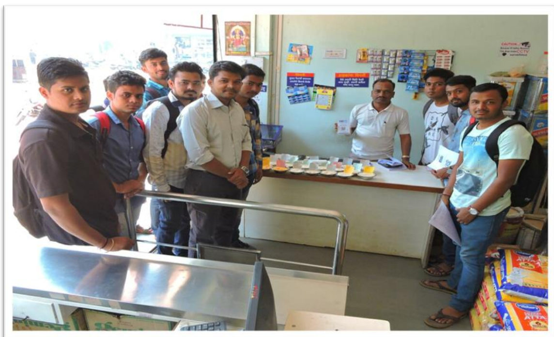
Group Photo=NSS Volunteers at Grocery Shop Information given to Shop Owner regarding Digital Payment