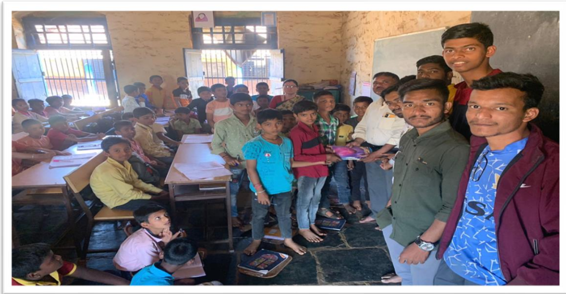
NSS Volunteers in primary school with children's during Notebook distribution