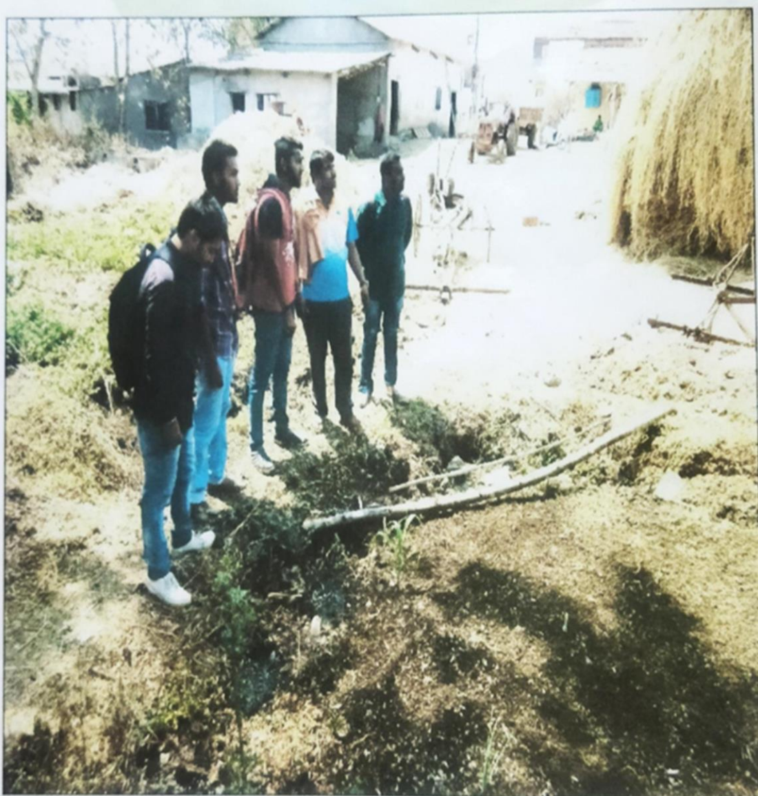
Students visit: At Bio Gas Plant