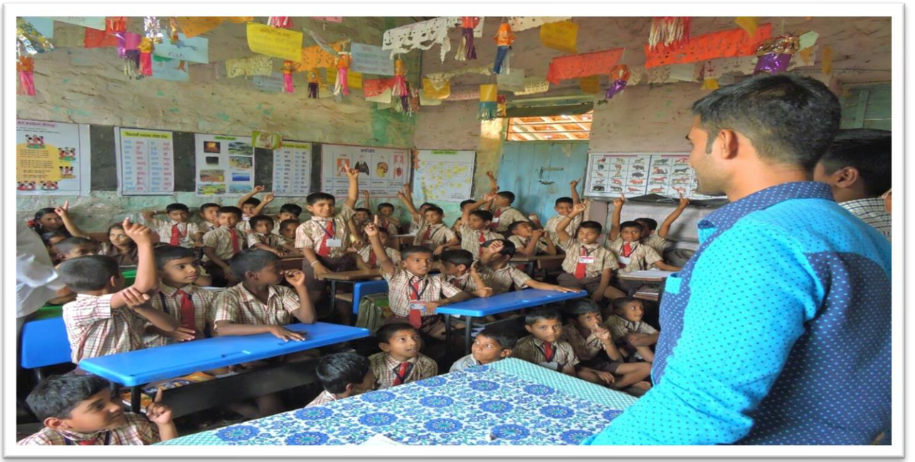
Information & Science Quiz at Primary School.