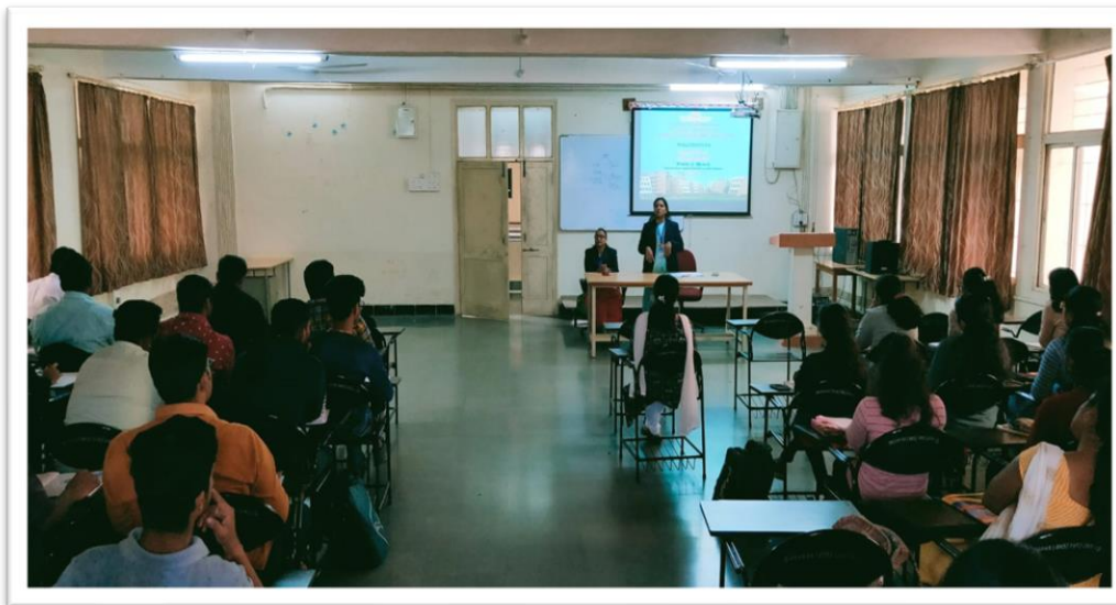
Audience at Seminar hall