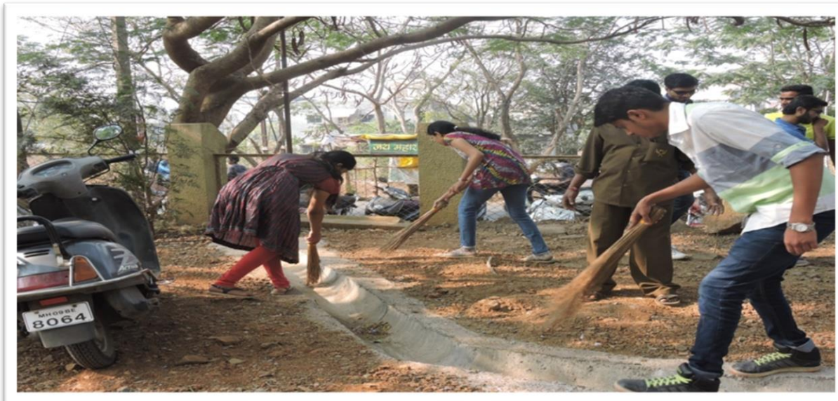
NSS. Volunteers Cleaning College Campus.