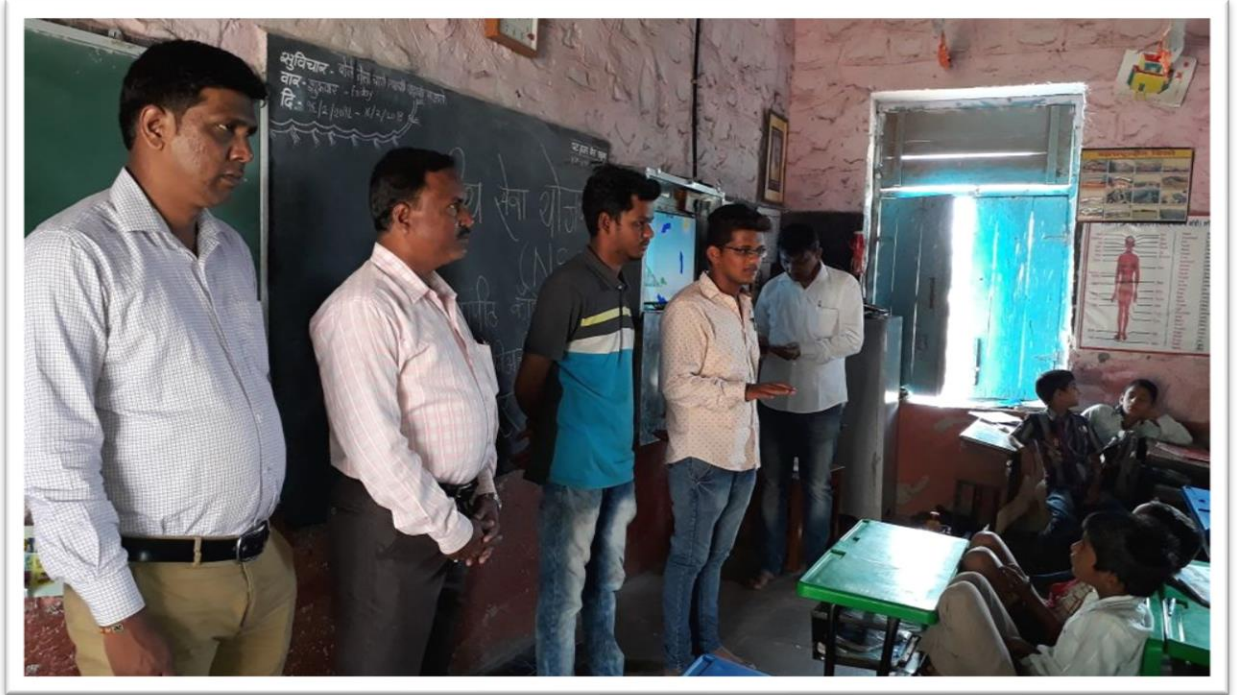
NSS coordinator & All NSS Volunteers Delivering Information about basics of Computer.