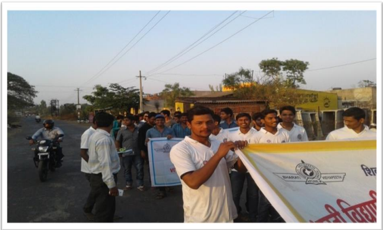
Group Photo-NSS Volunteers Rally