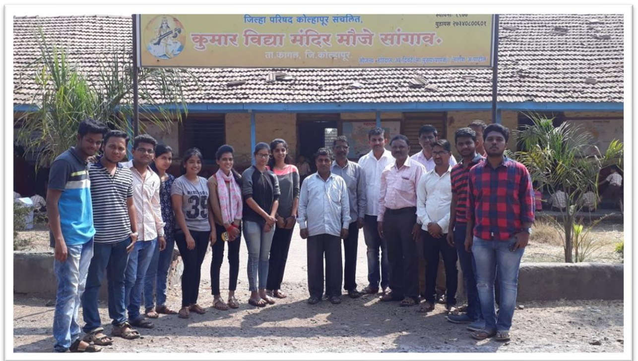
Primary School Staff. & NSS.Volunteers.