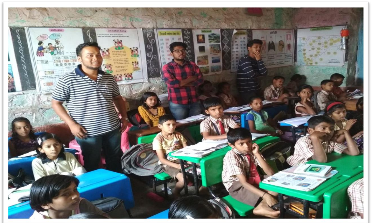
Organized Science Quiz at Primary School.