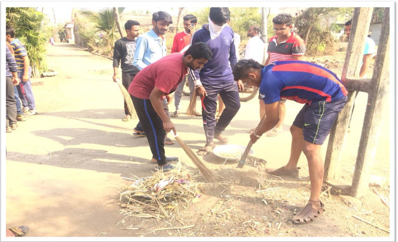
Working Group of NSS Volunteers.