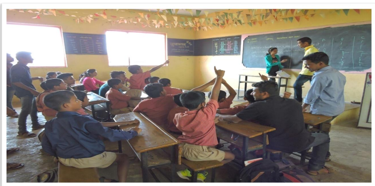
Teaching Lessons by NSS Volunteers