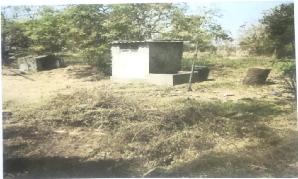
Photos-Biogas Plant at Kandalgaon Kolhapur