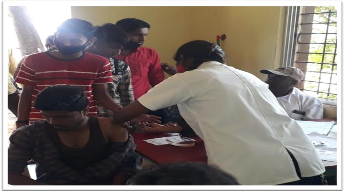
Covid Vaccination drive for college students in college campus