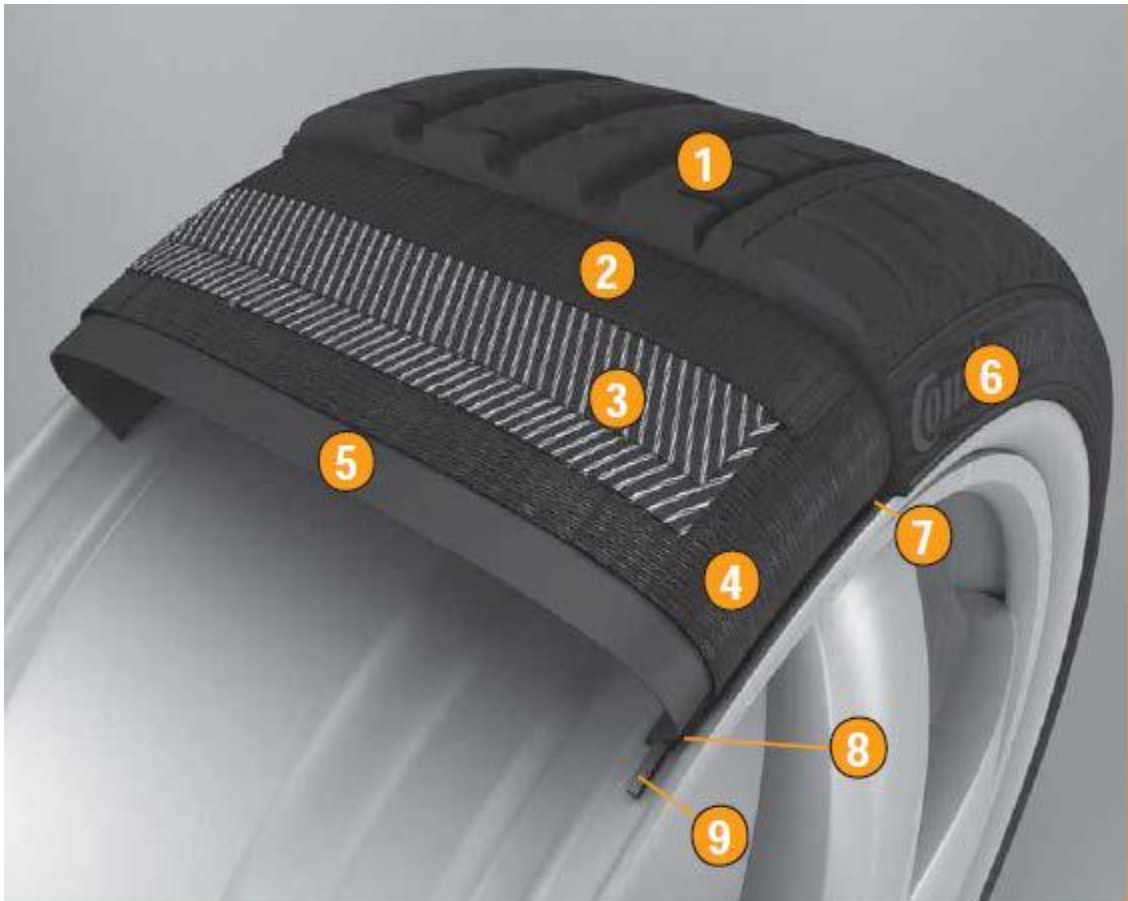
Fig.1 Tyre Components