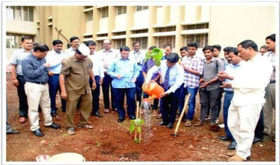
Tree Plantation in college campus