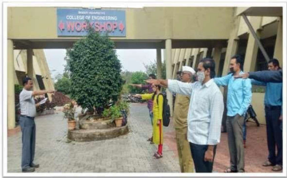
Harit Shapth (oath) by Teaching Staff & NSS Volunteers.