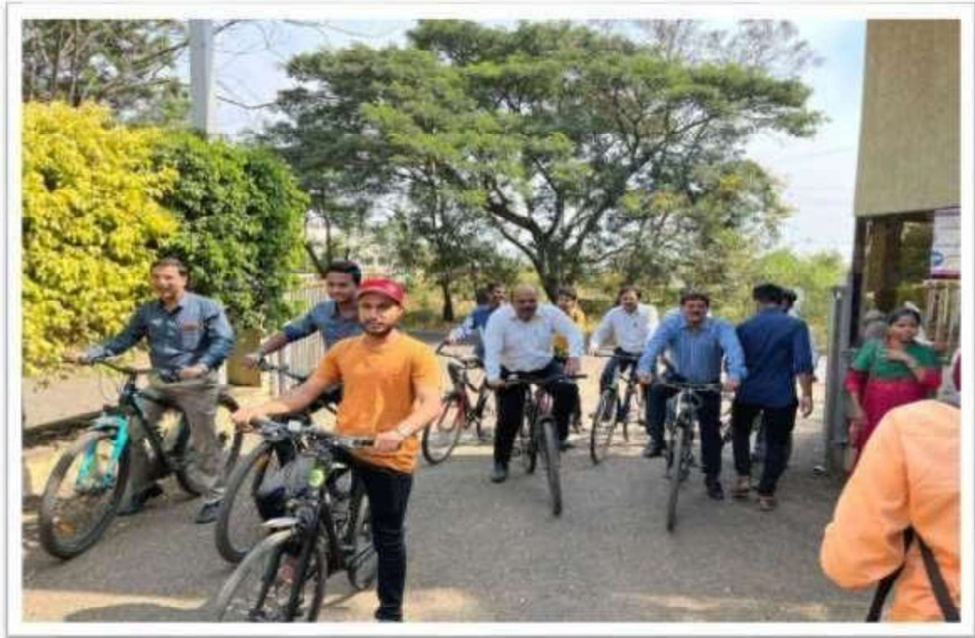
Celebration of No Vehicle Day at Institute