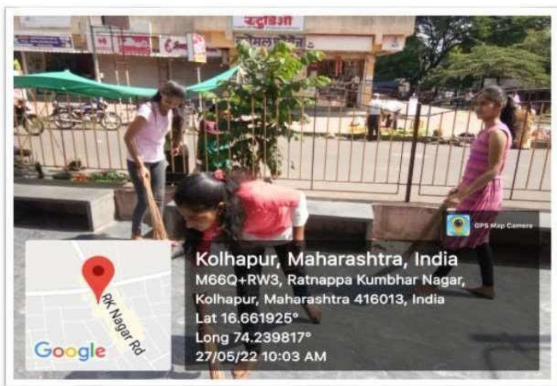
NSS Volunteers -Cleaning Temple & Road Area.