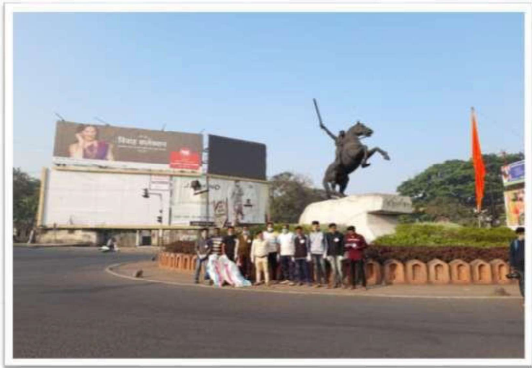
NSS Volunteers Collected Plastic Waste.