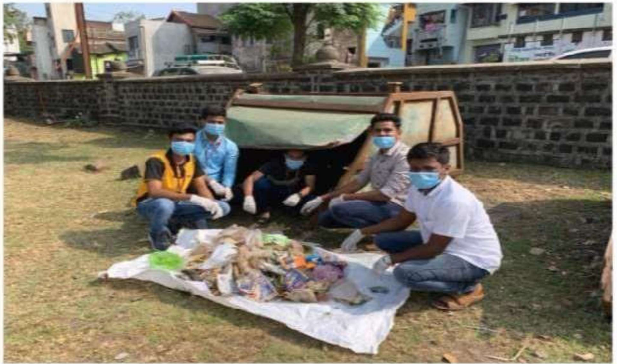
Plastic Waste Collection by NSS Volunteers