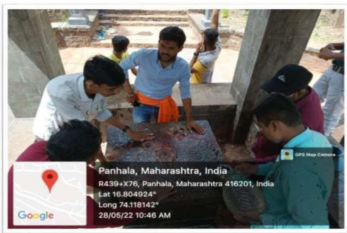
NSS Volunteers at Veer Shiva Kashid Samadhi, Nebapur Panhala