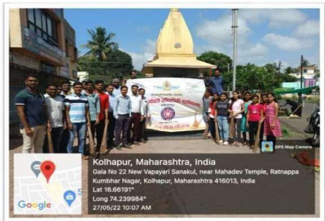
Participated Staff & NSS Volunteers