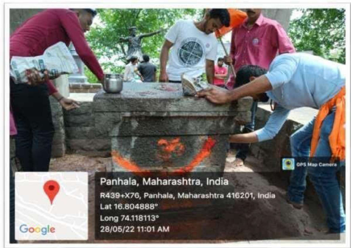
NSS Volunteers Cleaning Samadhi Parisarat Nebapur Panahala.