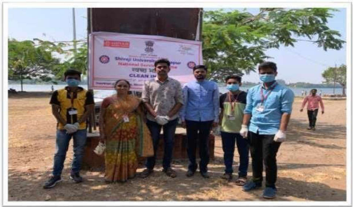
Rankala Lake View__After End of Drive.