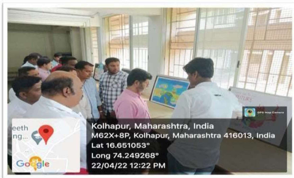
Poster presentation on occasion of world earth day 2022